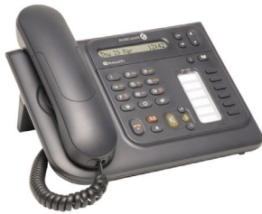
Alcatel-Lucent IP Touch 4008EE/4018EE Phones

The Alcatel-Lucent IP Touch™ 4008/4018 Extended Edition (EE) phones are cost-effective, entry-level desk phones that offer integrated IP connectivity and basic telephony.