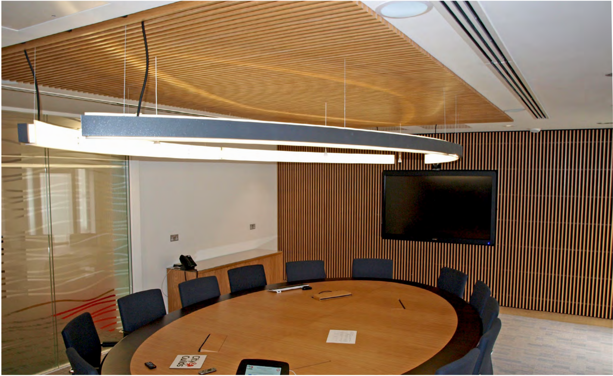
GRILL™ TYPE 7/1635/28 BACKER, WOOD VENEERED ACOUSTIC WALL & CEILING PANELS, EUROPEAN OAK