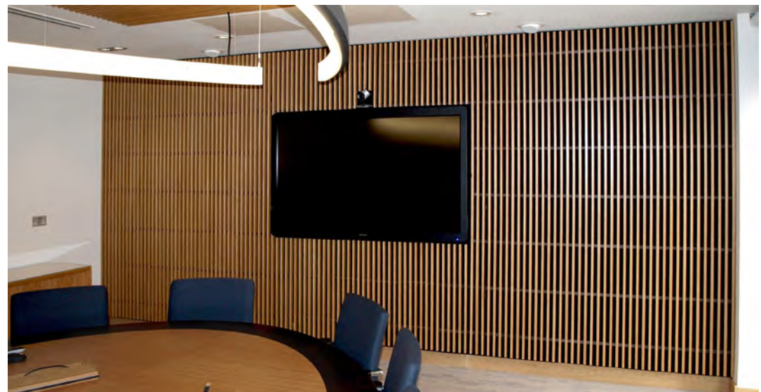
GRILL™ TYPE 7/1635/28 BACKER, WOOD VENEERED ACOUSTIC WALL & CEILING PANELS, EUROPEAN OAK