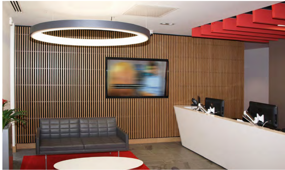
GRILL™ TYPE 7/1635/28 BACKER, WOOD VENEERED ACOUSTIC WALL & CEILING PANELS, EUROPEAN OAK