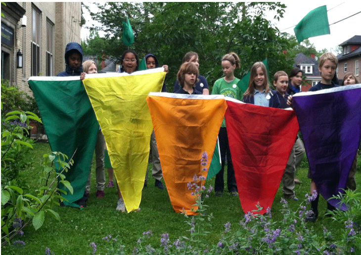
Pictured are students participating in EPA's School Flag Program

The schools are provided with various colored flags to be raised daily to signal the air quality condition. If the condition is good, it's safe to play outdoors. However, if the conditions are poor, the school will alter their daily schedule to move activities indoors. CRPC and Louisiana Clean Fuels have been targeting local schools to participate, and Kenilworth has signed on to be the first school in the area to participate!