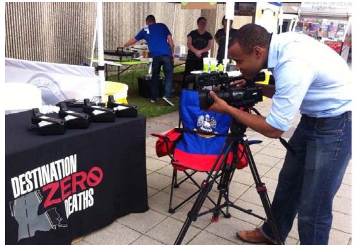
Destination Zero Deaths booth in use at Live After Five event

CRPC staff is working to update its website! We're giving a new look to CRPC's web presence, and also updating the content. Current maps, regional transportation information, and other features are in the works.