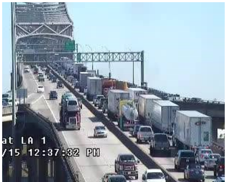
DOTD traffic cameras show heavy delay along I-10 in West Baton Rouge Parish at the Mississippi River bridge. Alleviating this congestion is a top priority for state, local, and regional leaders.

"Our most important goal is to find solutions to the La. 1 and I-10 traffic problems. This issue is so critical to our local employers, employees, citizens and emergency responders. We have preliminary construction plans for an alternate crossing over the Intracoastal Canal that would help open up the north and central parts of West Baton Rouge for development, while providing major traffic relief on La. 1. We are also exploring multiple Mississippi River crossing locations."