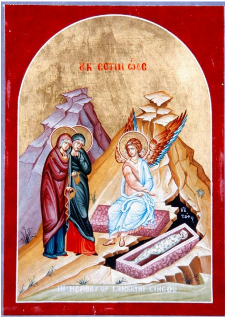
The Holy Icon of Christ as Angel