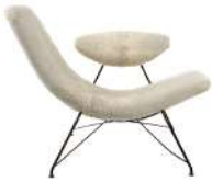
'REVERSIVEL' CHAIR FOR FORMA