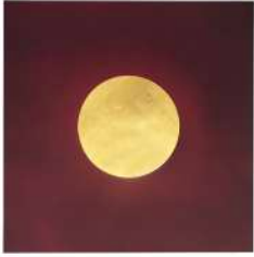
DEEP PURPLE FLASH