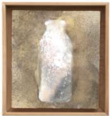
UNTITLED (MBmm 30)