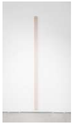
SEARCHING FOR REDS (BAR #13)