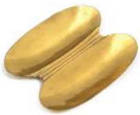
HAMMERED BRASS DISH

STILNOVO c. 1950 - 1959 BRASS 1 H x 8 W x 6.5 D inches