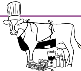
*sauce and pickles house-made*

HOUSEMADE SAUCES 1 garlic aioli . smokey bbq sauce . firecracker hot sauce . mayo (plain / malt / mustard / tom yum / vegan) . jalapeño jam