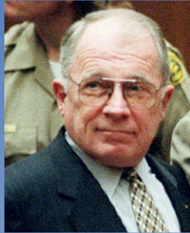
F. Lee Bailey