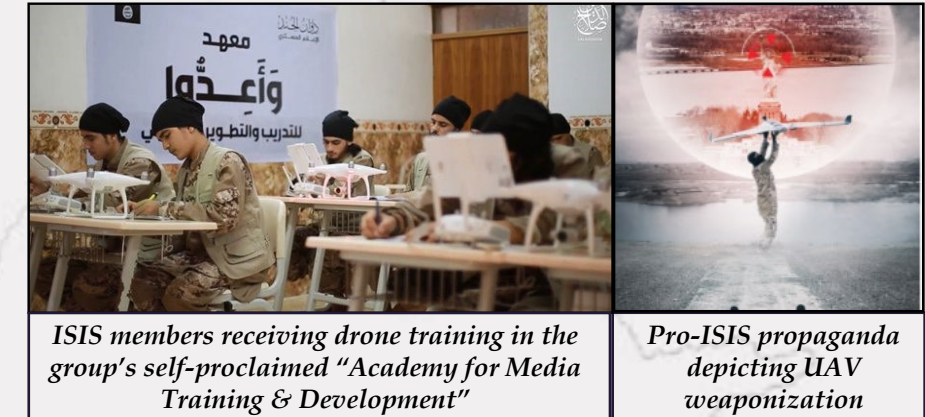
ISIS members receiving drone training in the group's self-proclaimed "Academy for Media Training & Development"