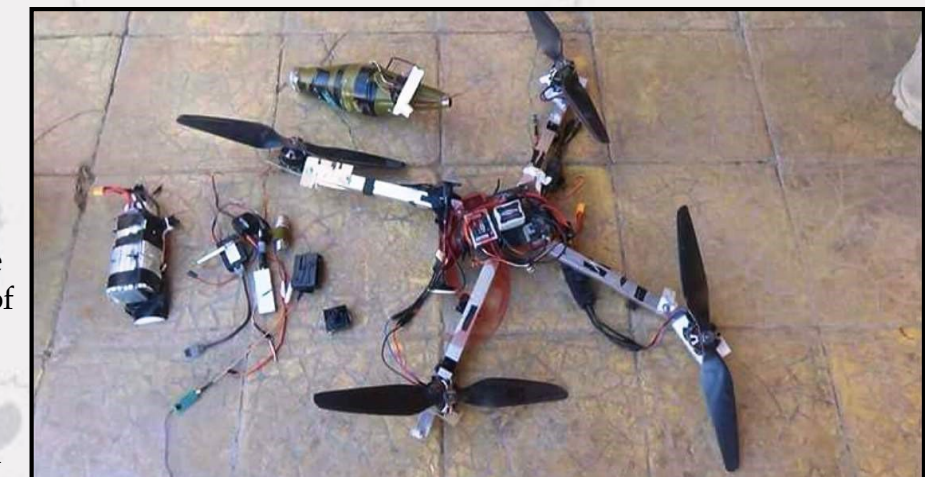
Weaponized UAV with customized IED