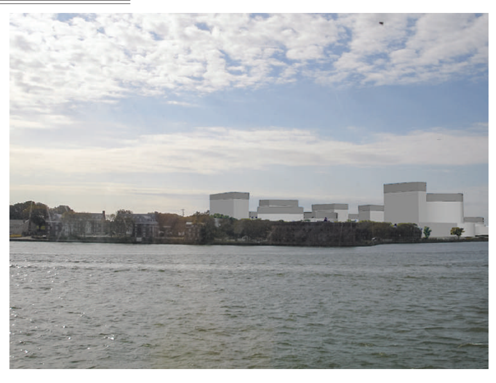
View with proposed development - Eastern & Western Development Zones