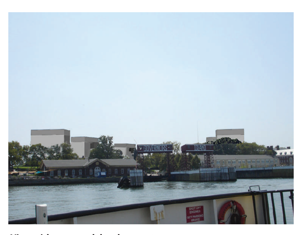
View with proposed development - Eastern & Western Development Zones