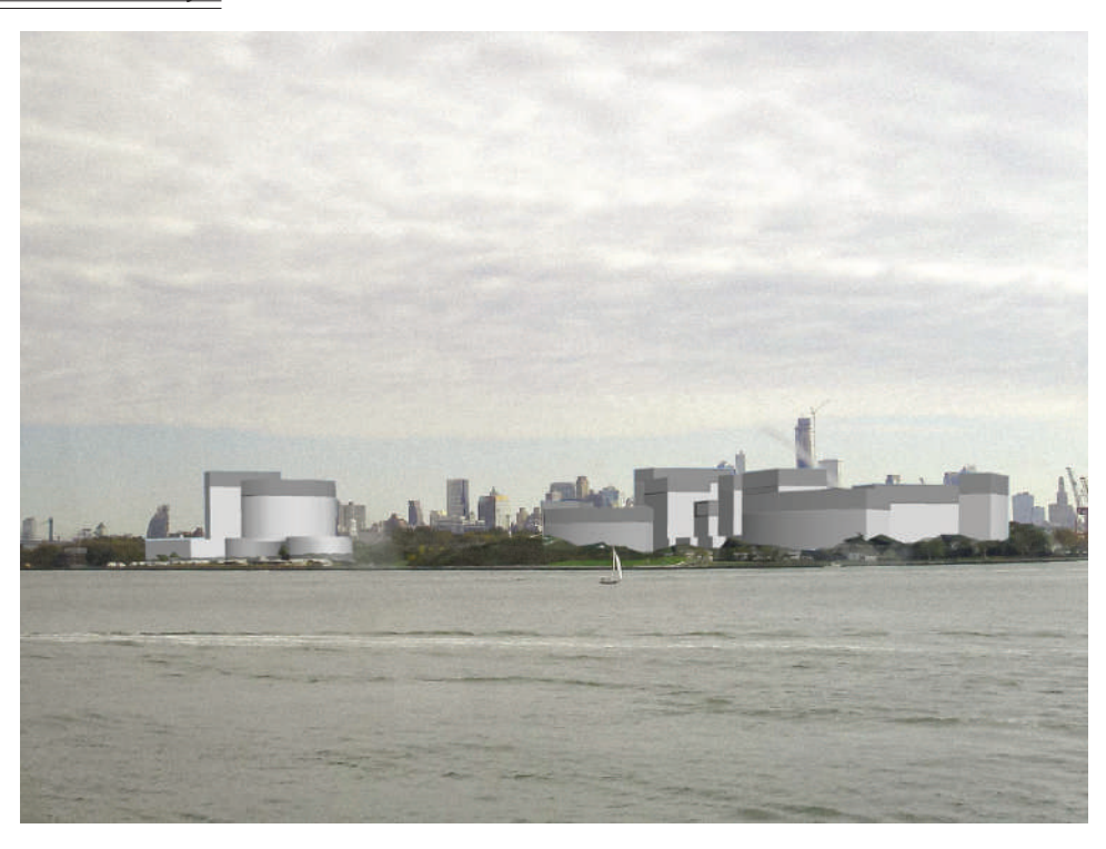
View with proposed development - Eastern & Western Development Zones