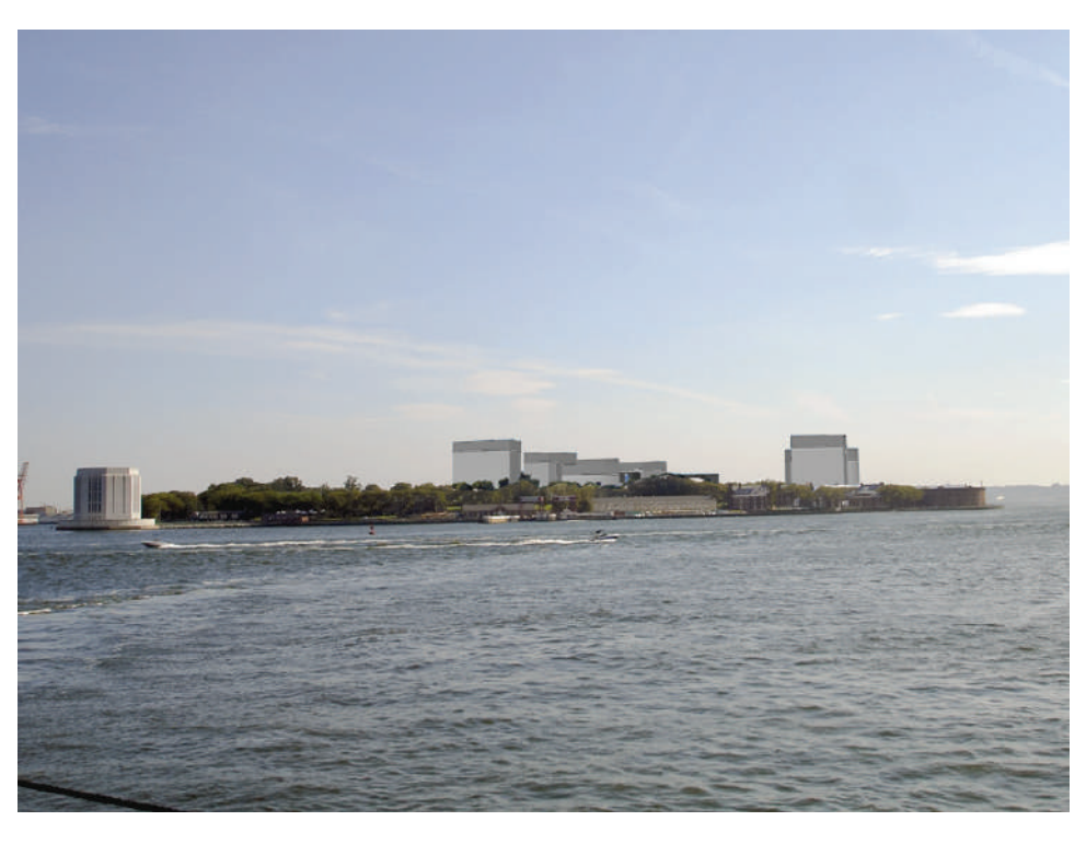
View with proposed development - Eastern & Western Development Zones