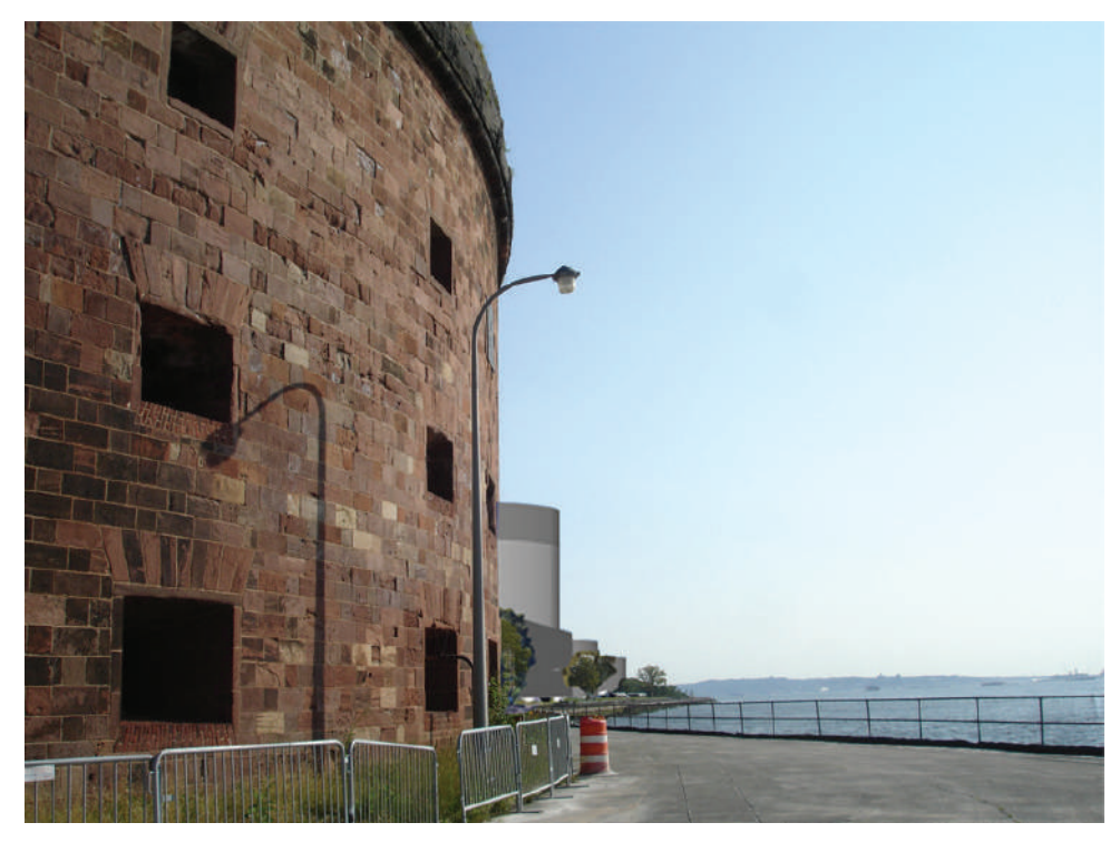
View with proposed development -Eastern & Western Development Zones