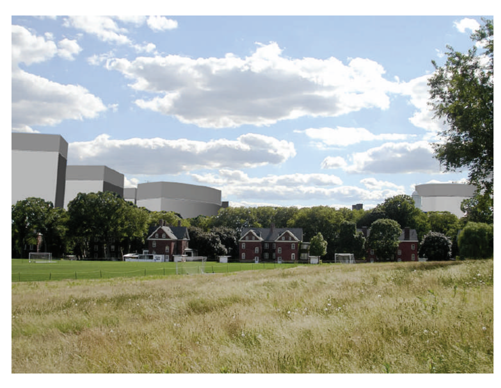
View with proposed development - Eastern & Western Development Zones