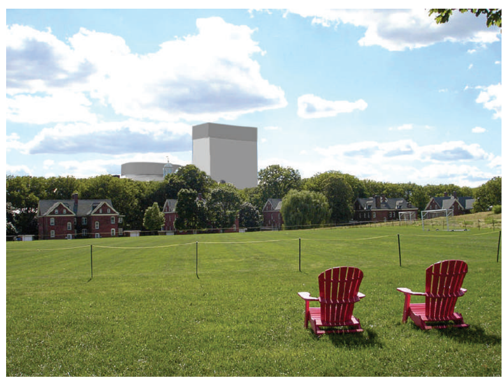
View with proposed development - Eastern & Western Development Zones