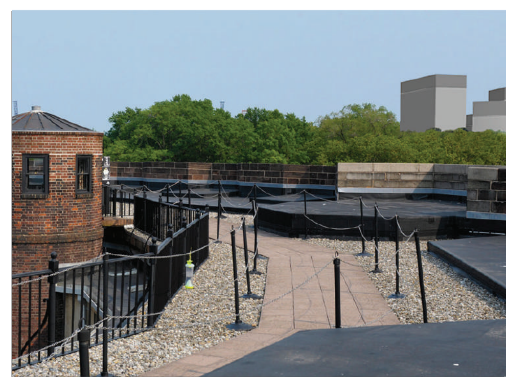
View with proposed development -Eastern & Western Development Zones