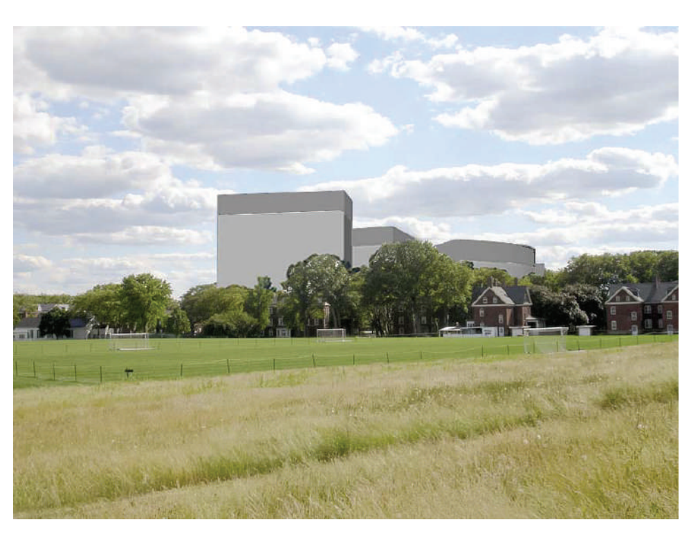
View with proposed development - Eastern & Western Development Zones