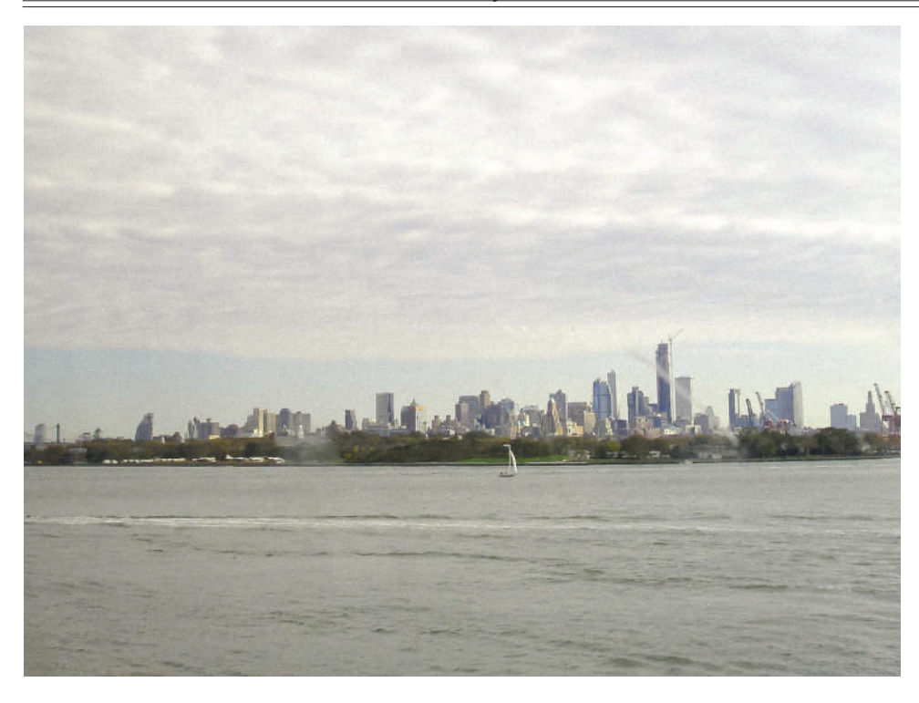
View B: View from Staten Island Ferry toward Governors Island & Downton Brooklyn