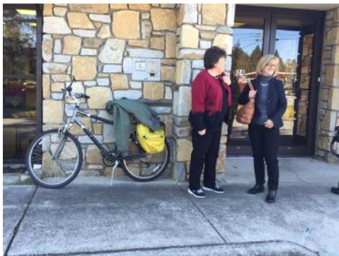
Cracked sidewalks in need of repair

Other groups not considered "working groups" are already contributing. SMART Recovery passes a basket monthly, and the Sierra Club has increased its annual contribution by 100%. Yoga is designed to raise funds--it's all part of the strategy to deal with the fact that those who have not retired with good pensions, or do not have truly affordable health care, are having a very hard time making significant contributions to their faith communities (this is not a unique UUTC problem). The concerts are also part of this strategy--possibly one of the better ones, because they pull in income from sources outside UUTC.