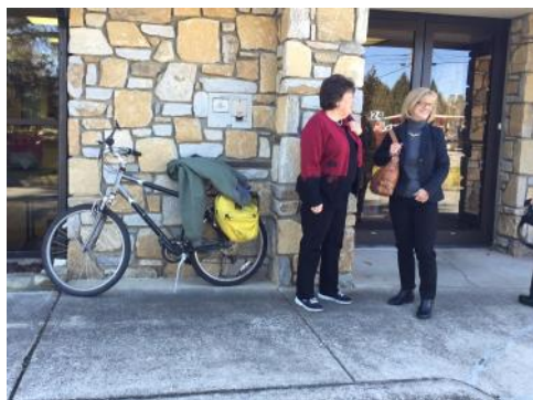
Cracked sidewalks in need of repair

Other groups not considered "working groups" are already contributing. SMART Recovery passes a basket monthly, and the Sierra Club has increased its annual contribution by 100%. Yoga is designed to raise funds--it's all part of the strategy to deal with the fact that those who have not retired with good pensions, or do not have truly affordable health care, are having a very hard time making significant contributions to their faith communities (this is not a unique UUTC problem). The concerts are also part of this strategy--possibly one of the better ones, because they pull in income from sources outside UUTC.