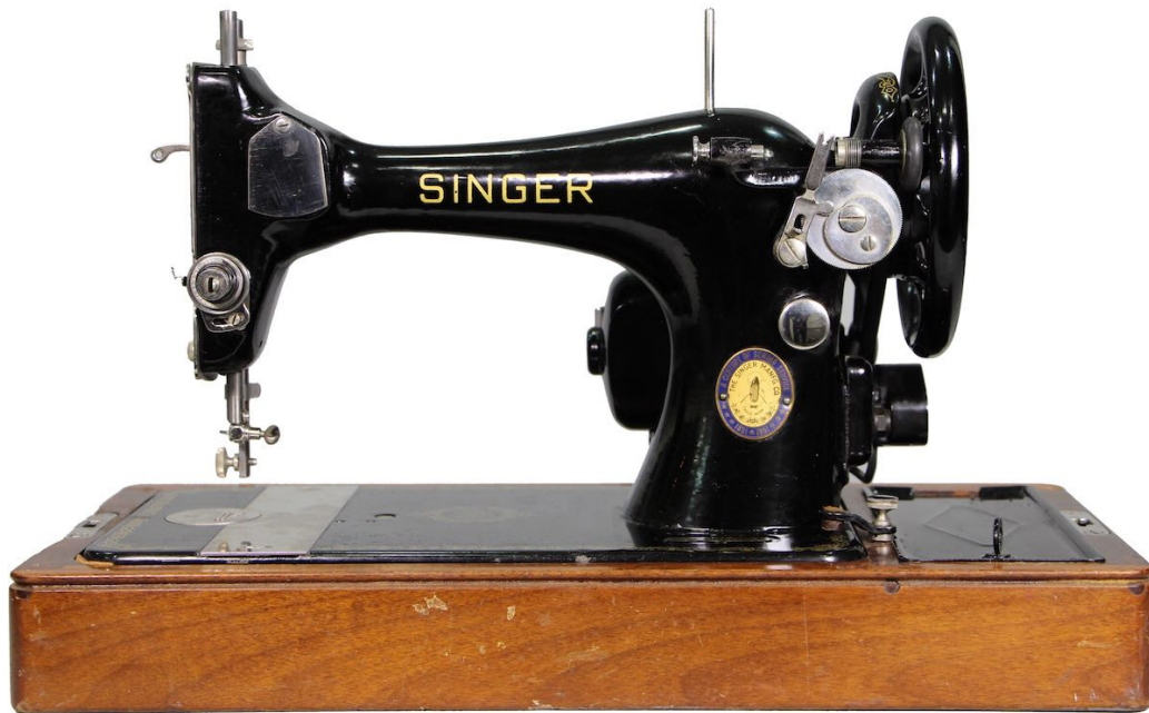
Restored Singer 128

Vintage Singer sewing machines that are for sale will range from some that are fully restored to some that look like junk. The best deals are machines that are dirty or even neglected. Vintage Singer sewing machines are very close to bullet proof so even one that looks like junk can often be rejuvenated with some TLC. With a little effort you can rejuvenate your Vintage Sewing Machine and restore it to its original glory.