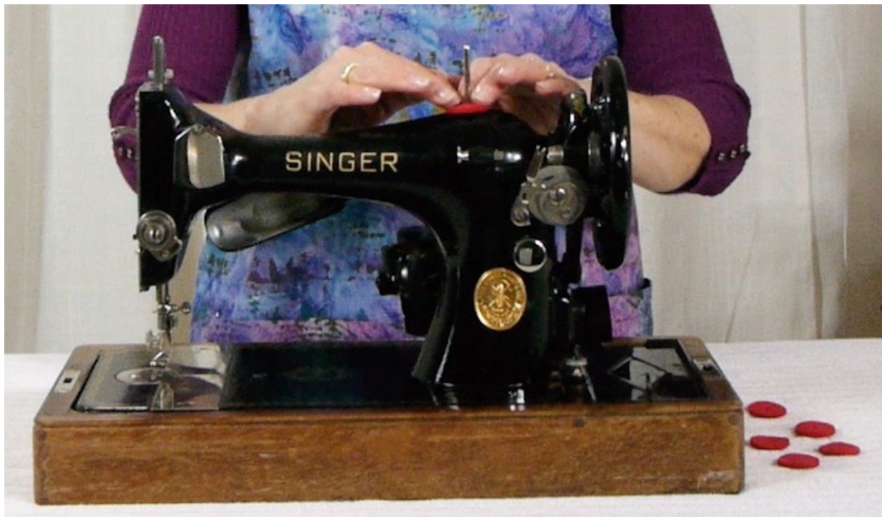
Spool Pad Replacement

Just take off the spool of thread, take off the felt, put new one on and done! This is the easiest "repair" that you'll do to your vintage sewing machine!