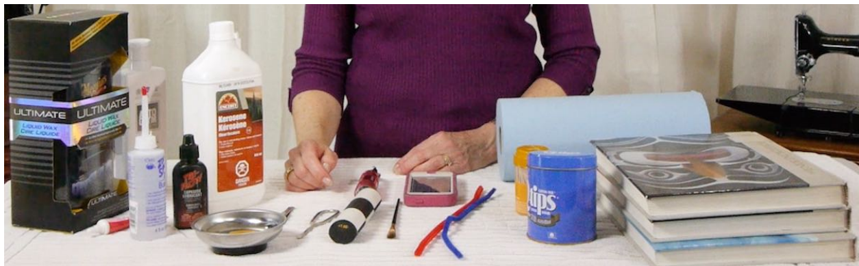
Tools & Cleaners