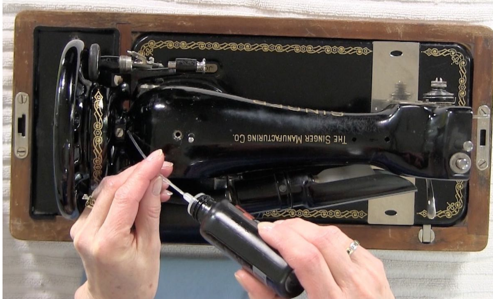
Oiling the Singer 128

Routine oiling of your machine is much less effort than what you may have had to do when you restored your machine. You only need to add a few drops on a regular basis or if your machine starts to feel stiff. Consult your manual for the location of the areas that need oiling. I use Tri-flow Superior Lubricant to oil my Singer sewing machines but you can use any good quality sewing machine oil. In general, apply a drop or two of oil to any place where two parts move together. Don't forget that some machines also have moving parts underneath the bed of the machine that need oiling. When you've finished oiling your machine run it at speed for about 2-3 minutes, to work the oil in, and then it's ready to sew.