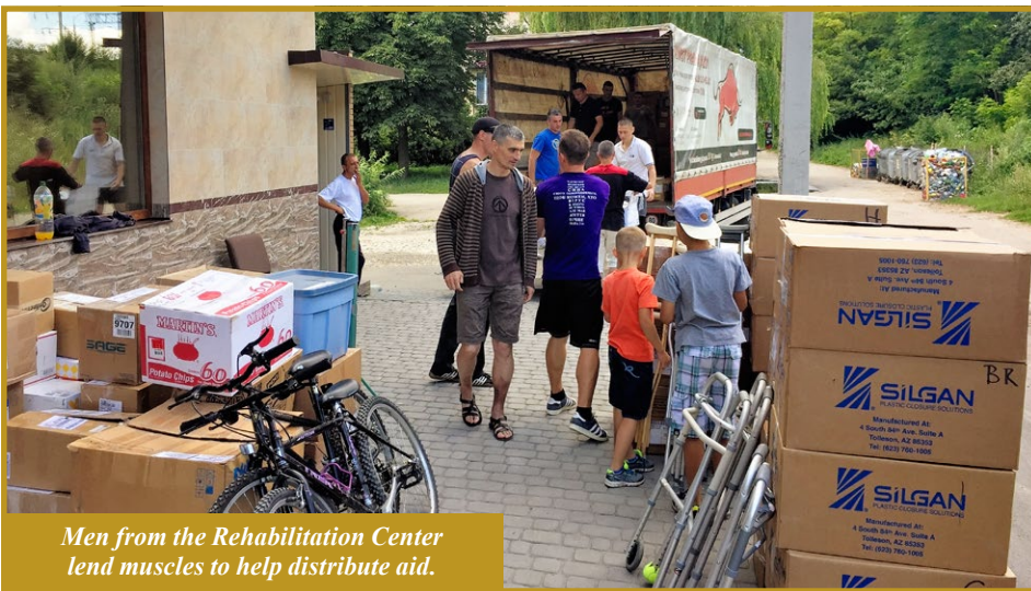
Men from the Rehabilitation Center lend muscles to help distribute aid.