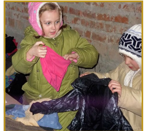
Yes, some kids really would be thankful to receive underwear for Christmas!

Since its independence, Ukraine has suffered from an economic crisis: low salaries, low pensions, corruption,