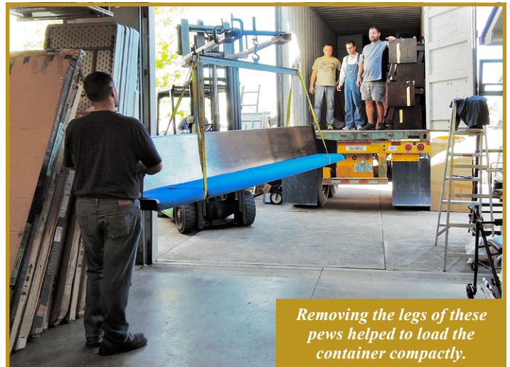
Removing the legs of these pews helped to load the container compactly.