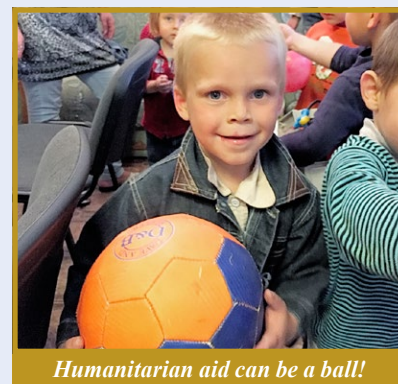
Humanitarian aid can be a ball!

a blessing from the Lord. Many believers today live poorly. Due to sanctions against Russia, life has become difficult here as well. Many people have no work. Those who do receive small wages of $100–$200 per month. So this clothing is a huge blessing. May the Lord reward those who donated the clothes and those fulfilling the ministry. Our sincere gratitude to you!