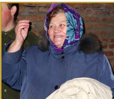
A mother praises God for clothing for her household.