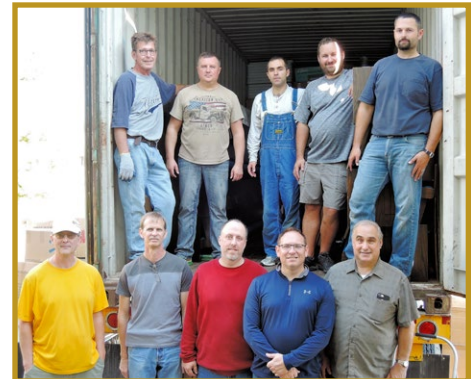
Tradition: our volunteers must pause for a photo.

Our Ternopil church enjoys good collaboration with Social Services in our city. They know people who truly need help and accompany them to our