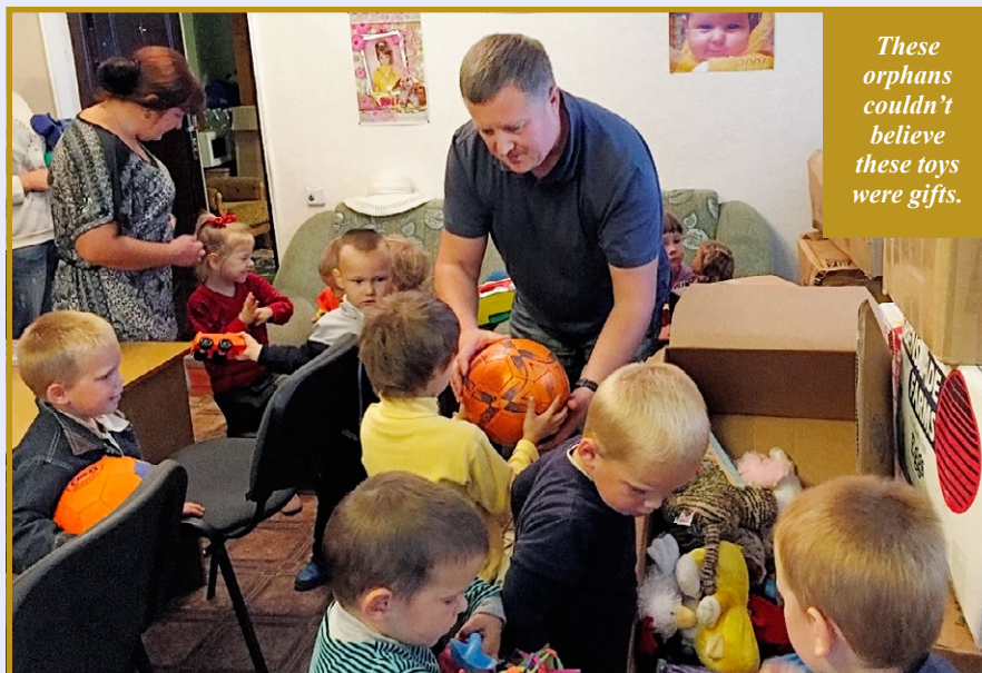
These orphans couldn't believe these toys were gifts.

One girl couldn't believe she owned her own beautiful doll. A boy so loved his ball he wouldn't set it down. In addition to making these kids' day, the visit resulted in an agreement for a missionary to teach Bible lessons each Thursday. Thank you for your donations to BIEM, which once again have warmed hearts and opened doors for the Gospel!