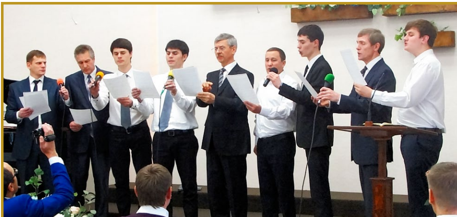
An all-male choir offered just one of many songs of praise for God’s goodness.

I pronounced twenty-two mercies aloud to the church, and twenty-two times the church responded about the eternal mercy of God. It was such a triumphant service!”