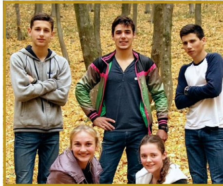
Diligent preparation makes for a confident team!

To begin, each team received a map of the forest, which marked locations of the various checkpoints they had to visit. Upon reaching a checkpoint, each team member was asked to solve a certain task using their knowledge of the Book of Judges. The Quest took almost the whole day, so lunch and beverages were provided along the way. In the end, everyone returned to the base, where their scores