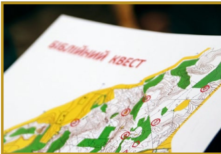
Each team received a map, which guided them to Quest tasks scattered throughout the forest.