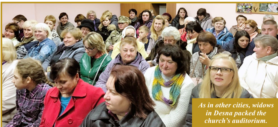
As in other cities, widows in Desna packed the church’s auditorium.