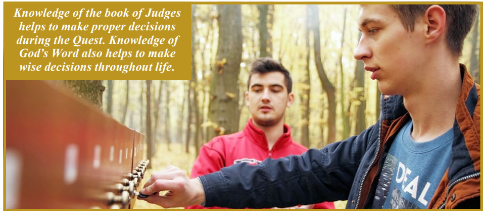
Knowledge of the book of Judges helps to make proper decisions during the Quest. Knowledge of God’s Word also helps to make wise decisions throughout life.