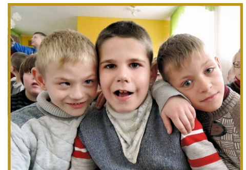
After hearing the Gospel in testimonies and a puppet show, orphans received age-appropriate gifts.