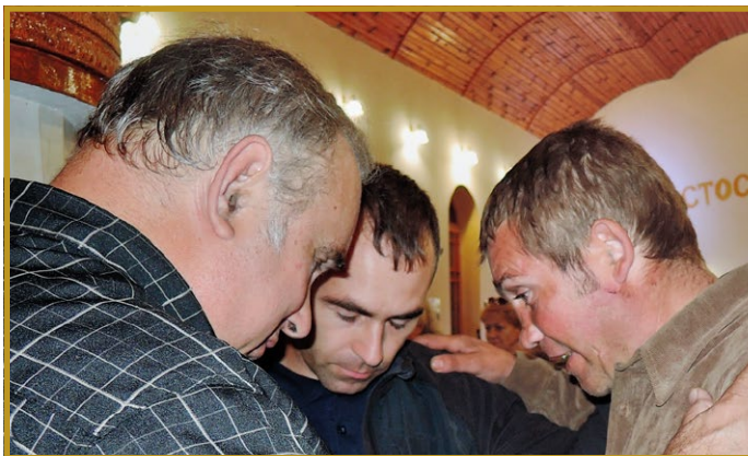
Of the many souls who accepted Christ during the widows’ services, one was this man on the right. Acquaintances told him the church in Fastiv had what he needed, so he showed up and heard the Gospel!

Throughout the course of this trip, over 700 widows and orphans heard the Gospel and received help. Pastors of the churches involved report they have gained regular attenders from these meetings. May the Lord work in hearts to save souls and make them church members! ■