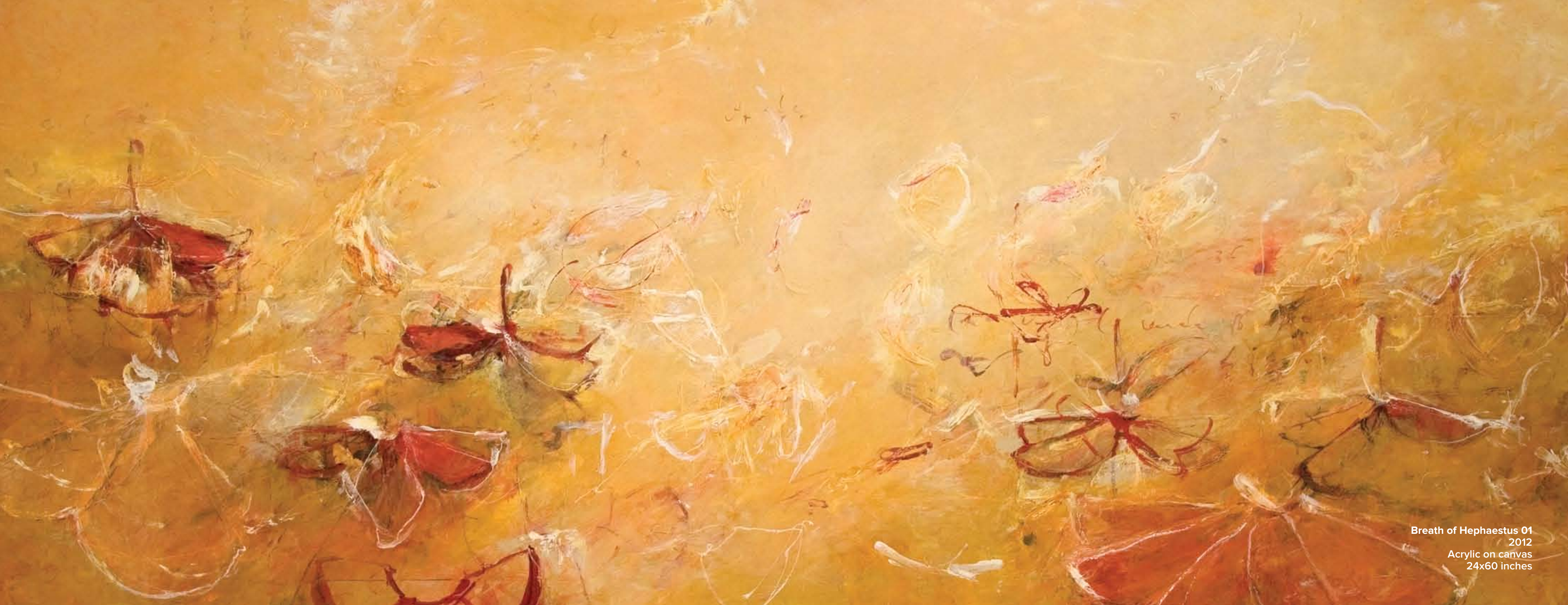
Breath of Hephaestus 01 2012 Acrylic on canvas 24x60 inches