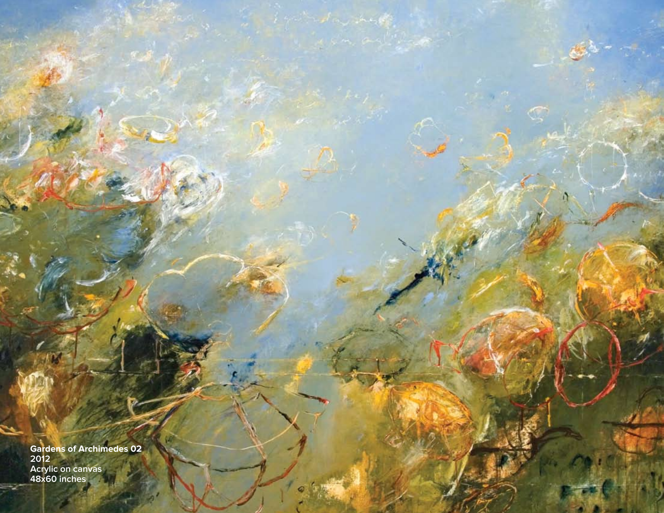
Gardens of Archimedes 02 2012 Acrylic on canvas 48x60 inches