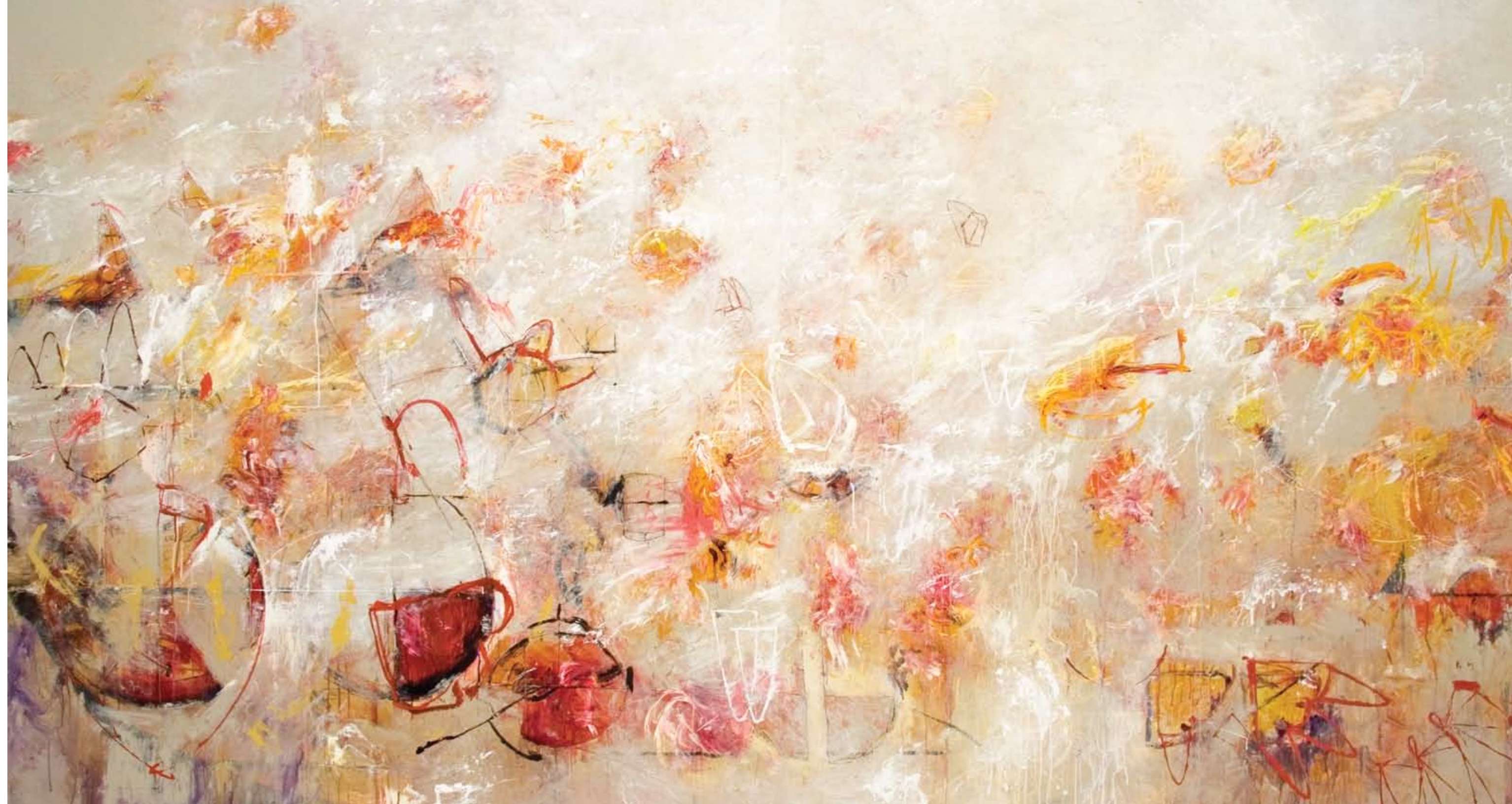
Breath of Archimedes 01 2012 Acrylic on canvas 72x120 inches