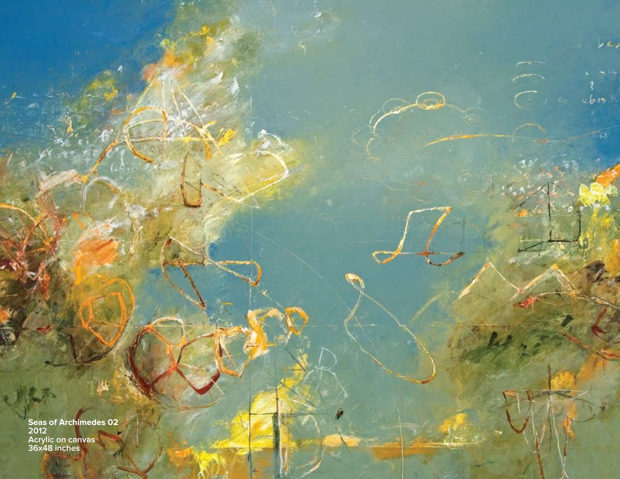
Seas of Archimedes 02 2012 Acrylic on canvas 36x48 inches