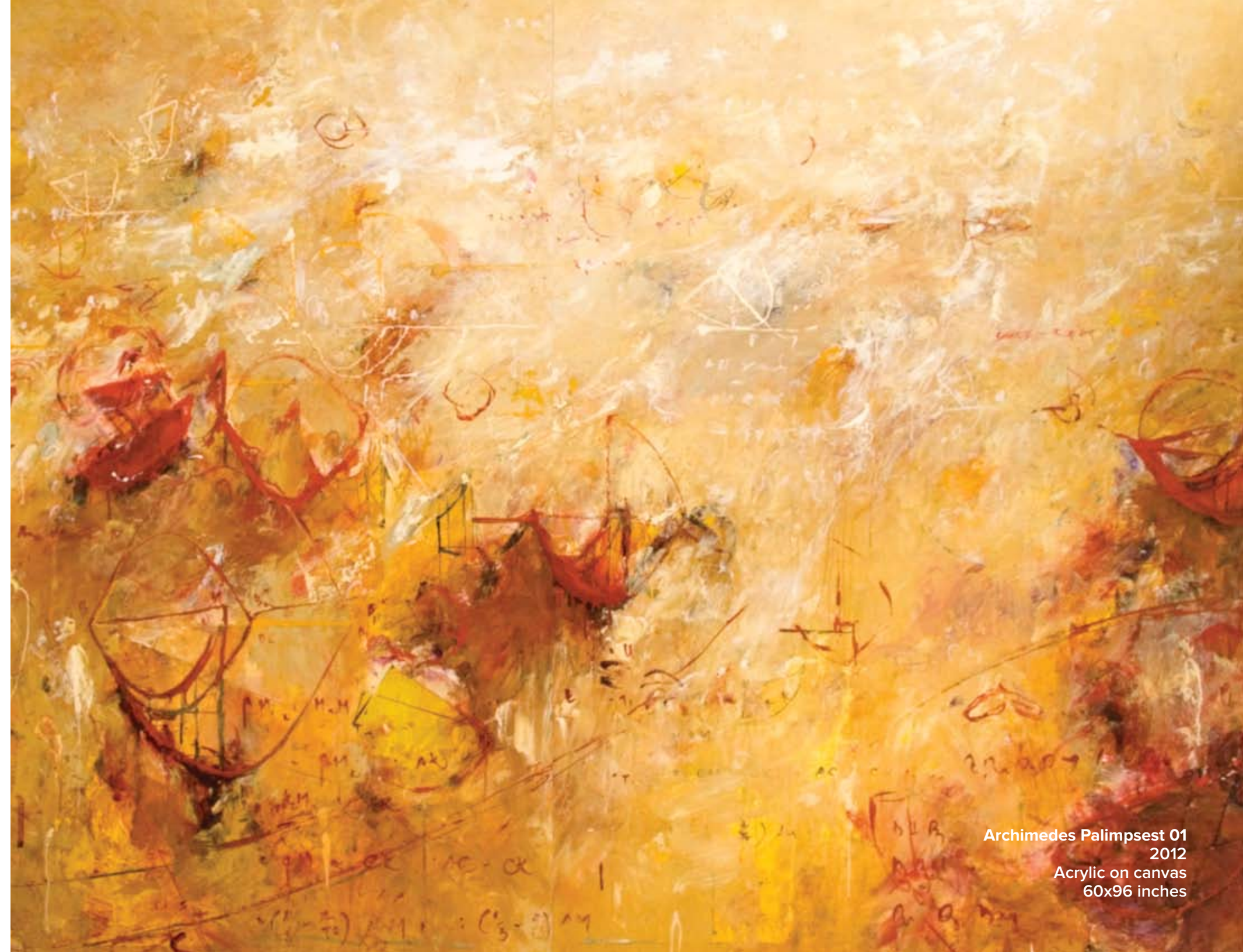
Archimedes Palimpsest 01 2012 Acrylic on canvas 60x96 inches