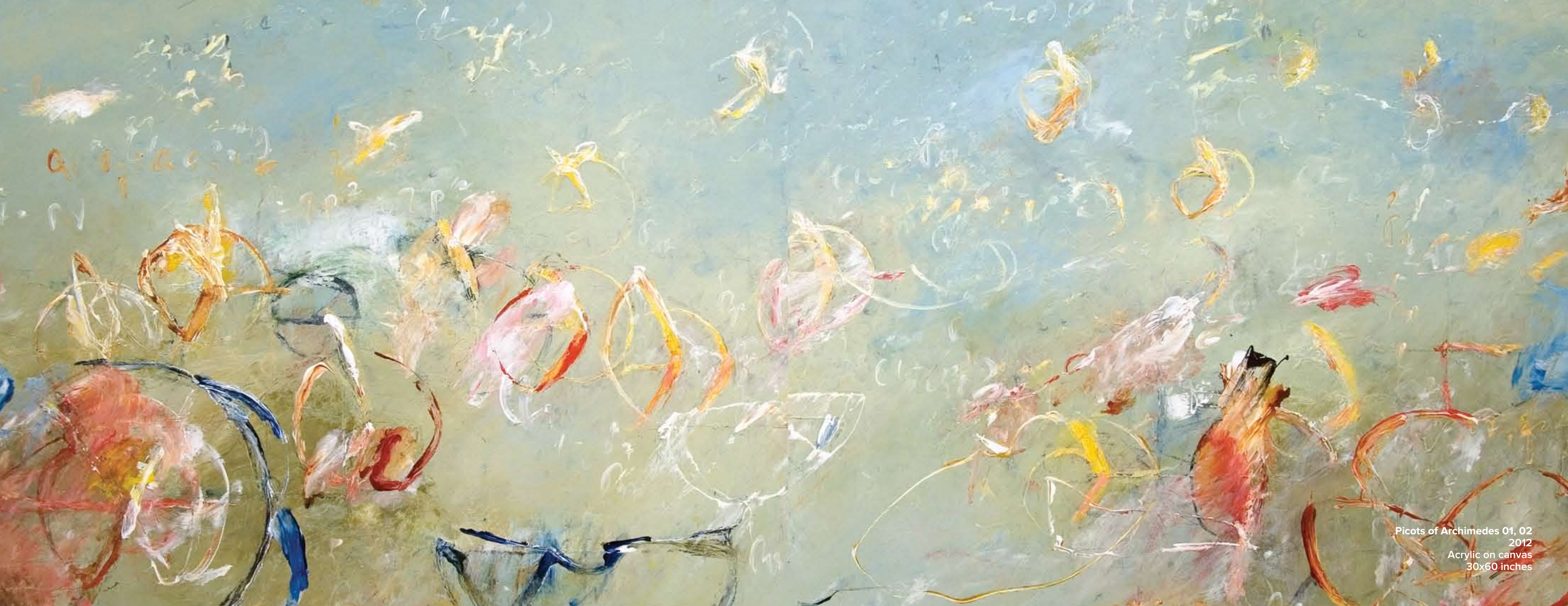
Picots of Archimedes 01, 02 2012 Acrylic on canvas 30x60 inches