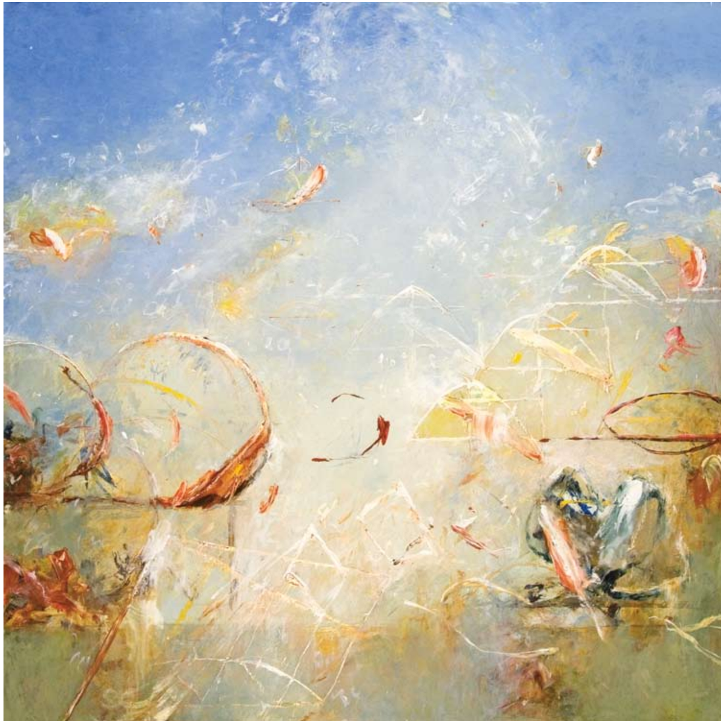
Archimedes Seasons 03 2012 Acrylic on canvas 36x36 inches