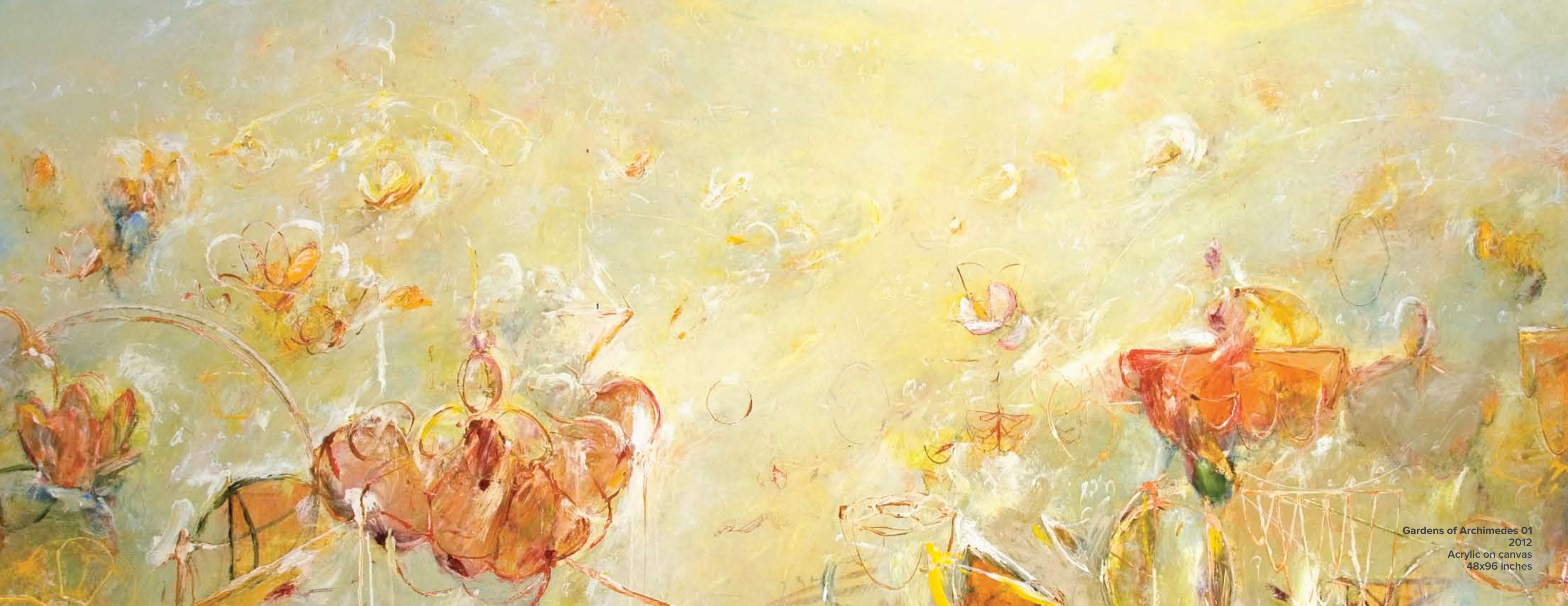
Gardens of Archimedes 01 2012 Acrylic on canvas 48x96 inches