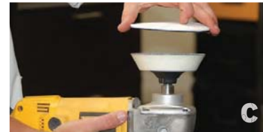
Center and velcro restoration disc or pad to back plate. Re-center if disc/pad spins unevenly.