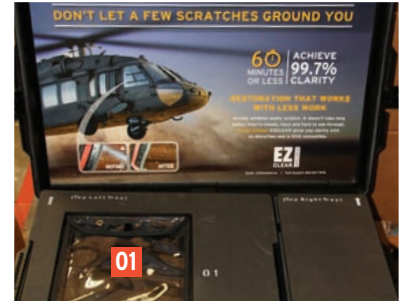
CLEAN & POLISH (UPPER TRAY)