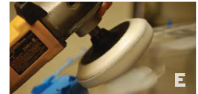
Compress disc/pad against surface and work polish into disc/pad to minimize overspray.