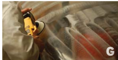
Polish the entire surface (including all edges and corners) with complete "Restoration Pass Sequences" to avoid distortion. A complete Restoration Pass Sequence equals: a) Buff left-to-right over the entire surface b) Buff top-to-bottom over the entire surface c) Buff diagonally over the entire surface