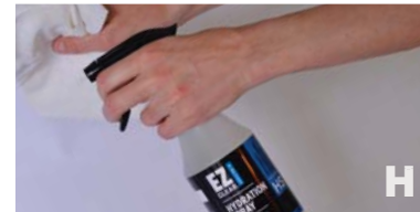
Reduce pressure when polish begins to dry and add Hydration Spray (2-3 sprays or more as needed). WARNING! DO NOT STOP IN ONE AREA AS THE HEAT CREATED MAY DAMAGE THE SURFACE.