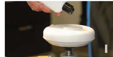
Re-apply Polish. MAJOR: Use new disc/syringe every 10 minutes. MINOR & FINISHING: Re-apply every 6-10 minutes.