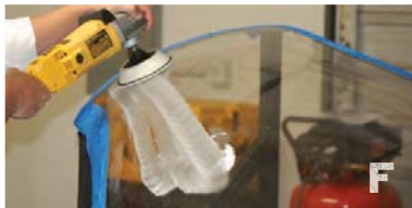
Slowly activate tool and maintain medium contact pressure between disc/pad and contour of surface.