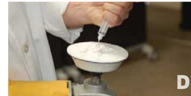
Dispense polish to disc/pad. MAJOR: Dispense entire syringe to disc. MINOR & FINISHING: SHAKE BOTTLE FIRST, then dispense quarter-sized amount (10cc) of polish to pad.