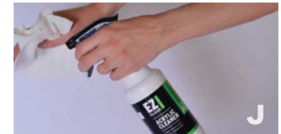
Once damage has been removed, clean the surface and surrounding tape with EZCLEAR® Acrylic Cleaner and an EZCLEAR® Microfiber Towel. WARNING! REMOVE ALL GRIT. TRANSFERRING POLISHES BETWEEN STEPS WILL CAUSE ADDITIONAL SCRATCHING TO SURFACE.