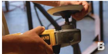
Attach backing plate to tool. MAJOR: Either curved or flat surface backing plate from Major Restoration Starter Kit. MINOR & FINISHING: Select either 3" or 6" size backing plate.