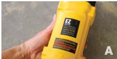
Ensure RPMs are set to 1400.