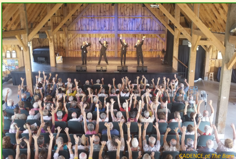
GADENCE at The Barn

Tickets available to Members ONLY, until January 25, 2016