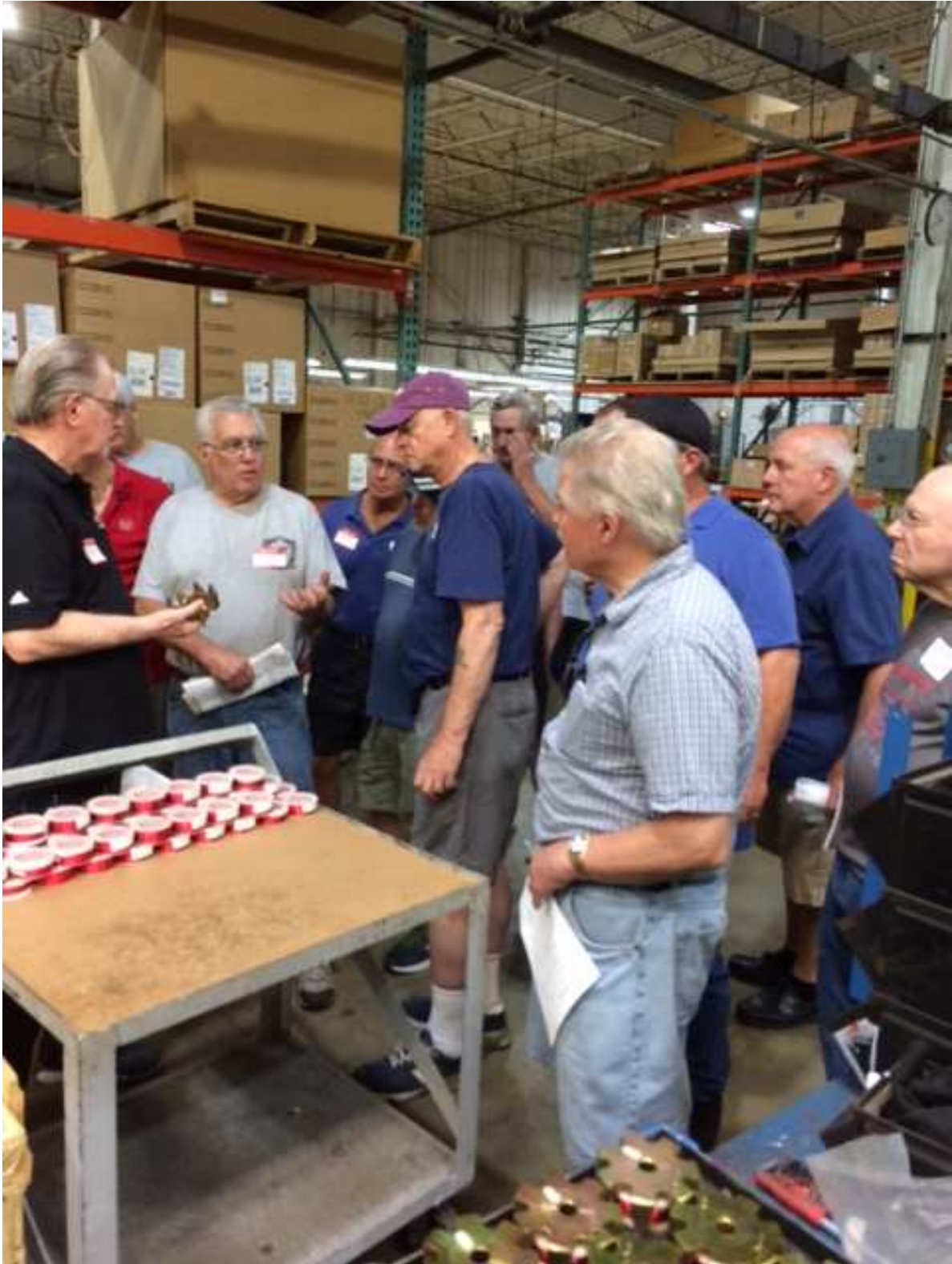
June 10, 2017 Power Master Tour