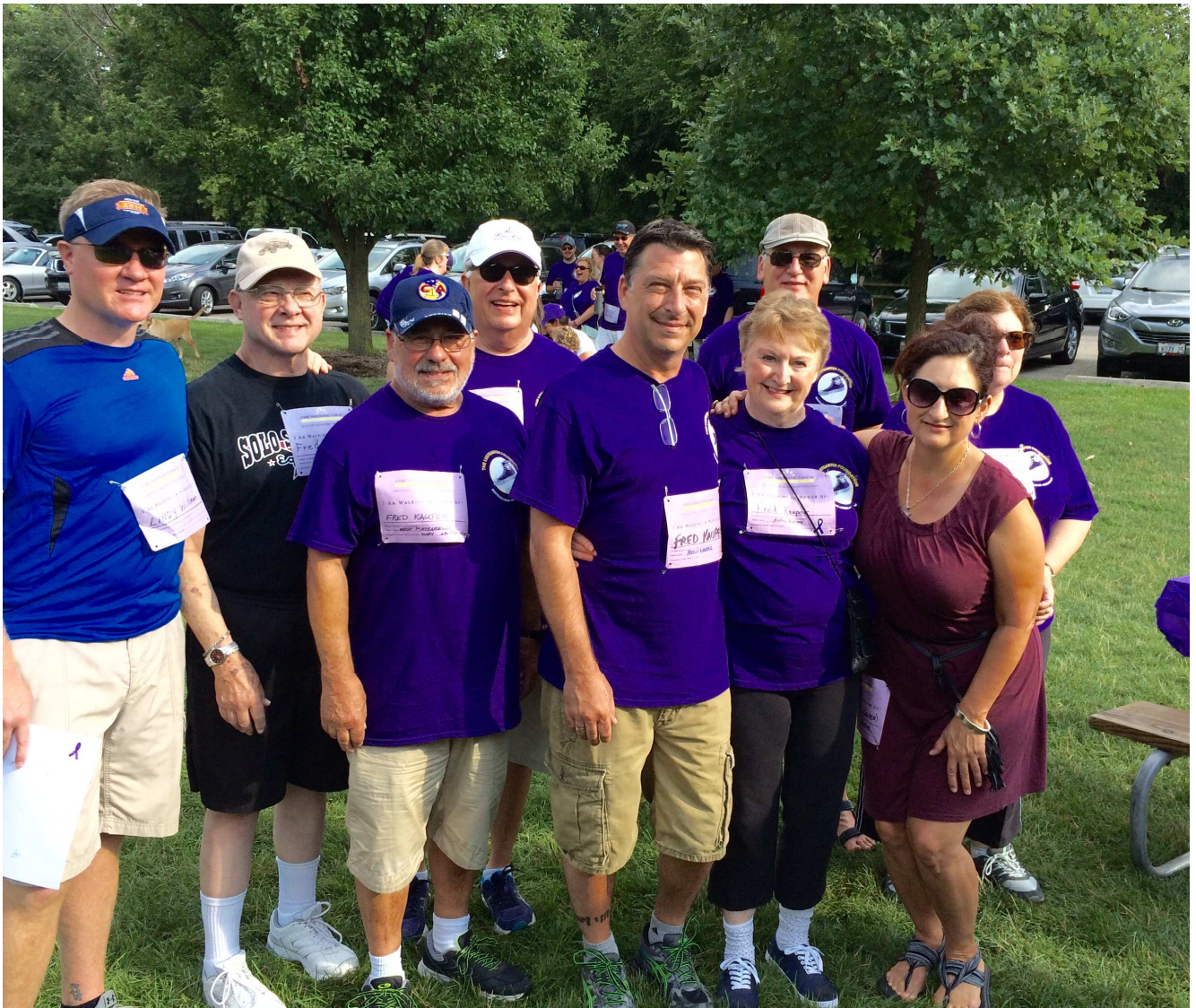
Team Fred - July 23 rd 2017 Naperville Pancreatic Cancer Walk