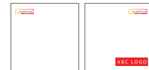
Top Badge Placement