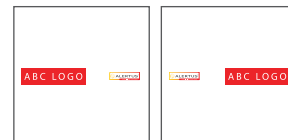
Right / Left Badge Placement