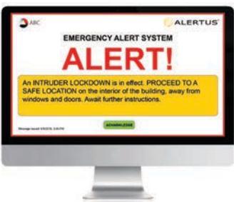
Alertus Desktop™ Notification can deliver a facility-wide emergency notification in a matter of seconds.