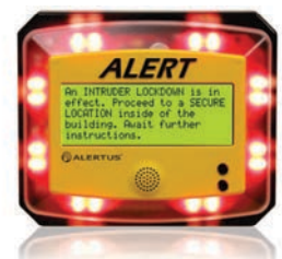
The wall-mounted Alertus Alert Beacon® sounds, flashes, and displays an alert message in the event of an emergency.

Jones has since added more than 30 Alertus Alert Beacons® — wall-mounted devices that can be installed almost anywhere, produce attention-grabbing bright flashes and loud sounds, and display a custom message about the nature of the emergency and how to respond — and Alertus Text-to-Speech Self-Amplified Speakers in the Gordon’s science center for clear, intelligible audible alerting on the PA system.