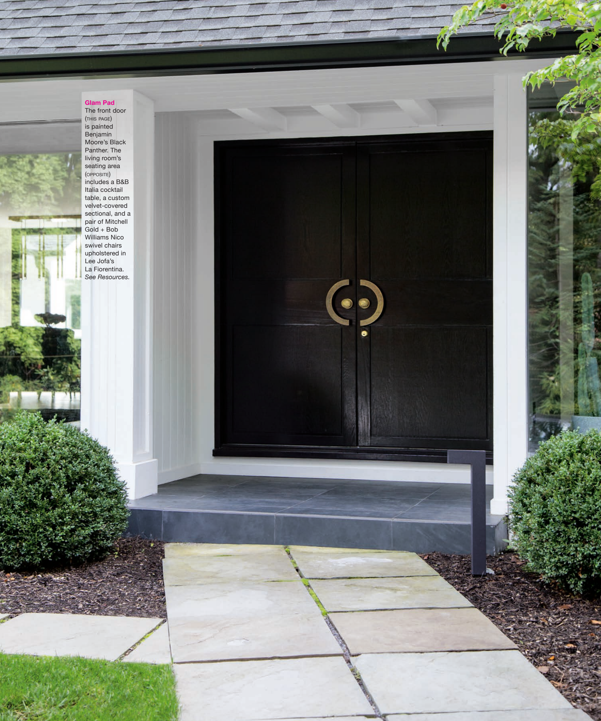
Glam Pad The front door (THIS PAGE) is painted Benjamin Moore's Black Panther. The living room's seating area (OPPOSITE) includes a B&B Italia cocktail table, a custom velvet-covered sectional, and a pair of Mitchell Gold + Bob Williams Nico swivel chairs upholstered in Lee Jofa's La Fiorentina. See Resources.