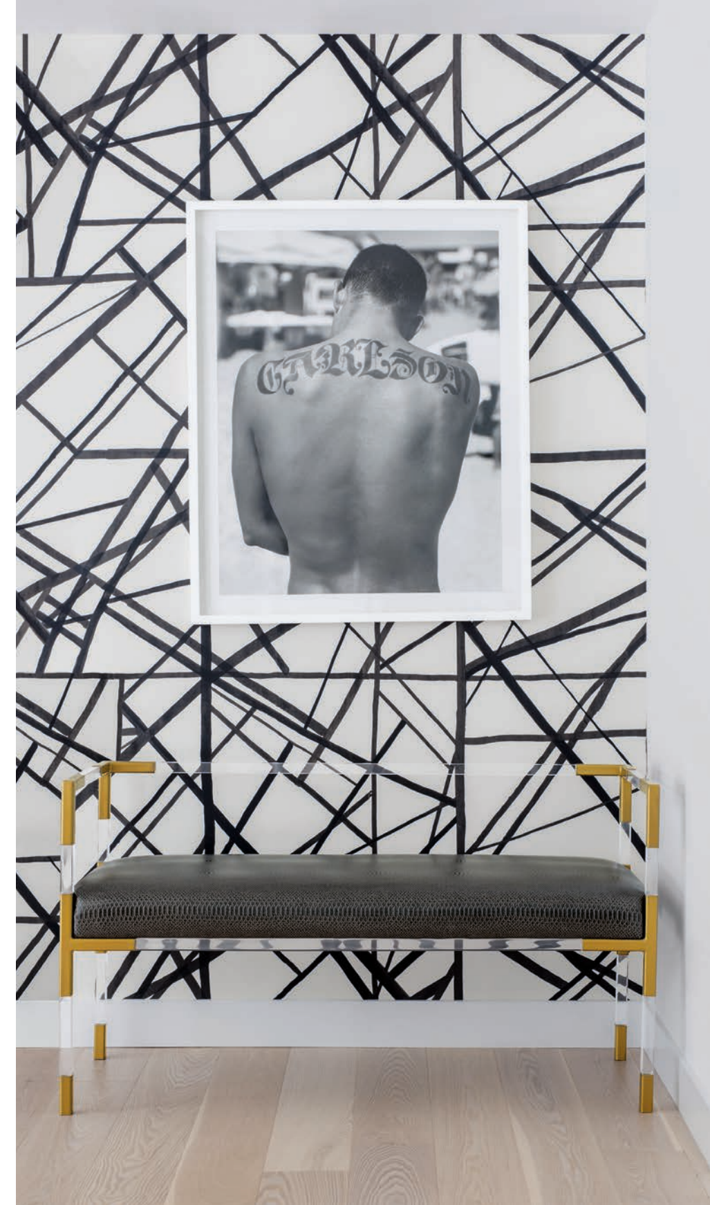
Energy Forces In the study (OPPOSITE), a Cameron Design House chandelier illuminates a leather-covered desk. Vessel sinks from Signature Hardware sit atop a maple vanity in the guest bathroom (NEAR LEFT); the faucets are from DXV and the mirrors are from Blu Dot. In a first-floor hallway (ABOVE), Michael Dweck's photograph Carlson's Tattoo is displayed on a wall covered in Kelly Wearstler's Channels wallpaper. See Resources.