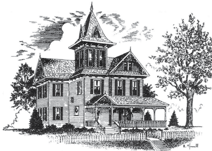
Charles Pilla House: 614 Main Street, Eudora, Ks