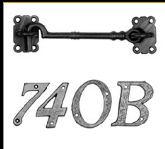
CABIN HOOKS 3,4,6,8,10,12,14 & 16in LETTERS & NUMBERS 2in