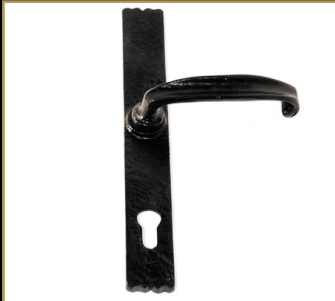
BLACK DOOR LEVER/LEVER & OFFSET LEVER/LEVER