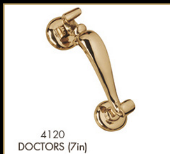
4120 DOCTORS (7in)