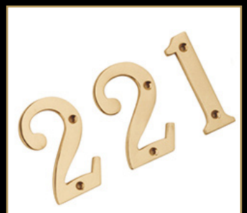
LETTERS & NUMBERS 2in

Designed & Hand Made in the United Kingdom