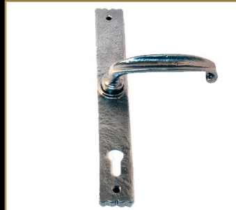
PEWTER DOOR LEVER/LEVER & OFFSET LEVER/LEVER