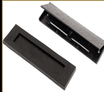
FLUSH BLACK LETTER PLATE SET