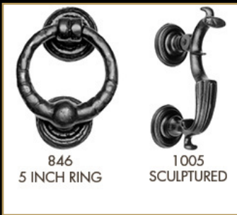
846 5 INCH RING