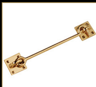
CABIN HOOKS 3,4,6,8,10,12,18 & 24in