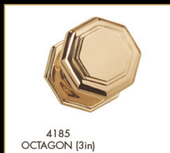
4185 OCTAGON (3in)