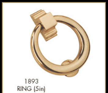
1893 RING (5in)