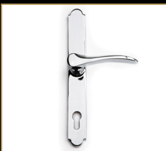
DOOR LEVER/LEVER & OFFSET LEVER/LEVER