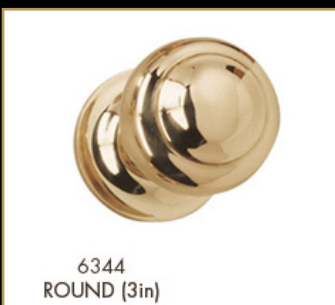
6344 ROUND (3in)