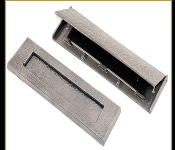
FLUSH PEWTER LETTER PLATE SET