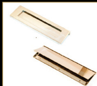
FLUSH LETTER PLATE SET