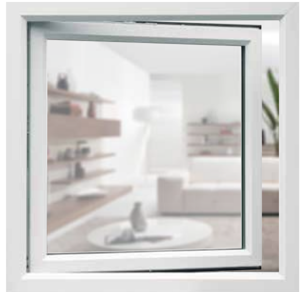
SIDE-HUNG FOR EGRESS AND CLEANING