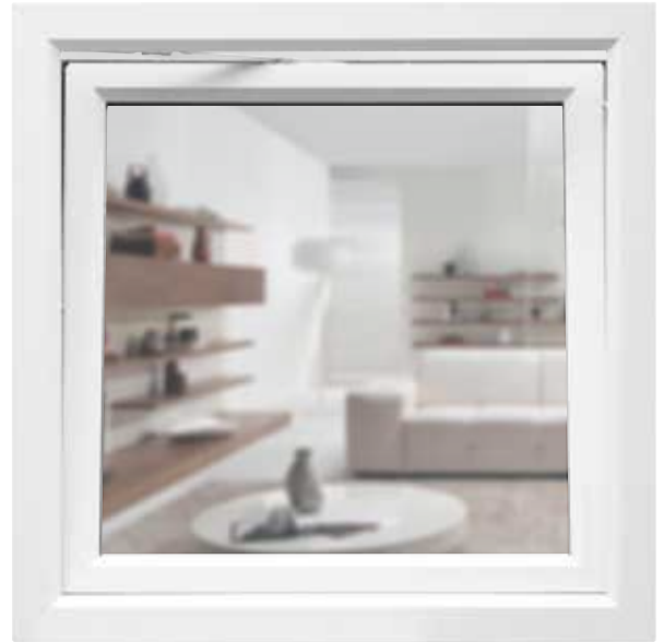
BOTTOM - HINGED TILT FOR VENTILATION

As each sash opens inwards, it means you can clean the external face of the windows from indoors - no ladders, no hassle. This makes them ideal for inaccessible locations where a ladder wouldn't be able to reach.