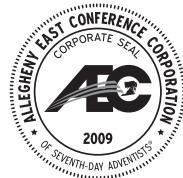
Seal Black Version File name: Allegheny seal_k.eps