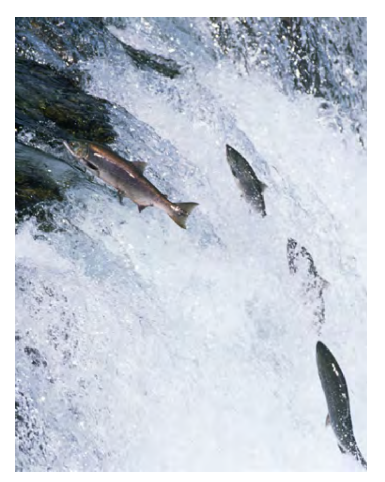
Figure 4: Salmon migrating upstream