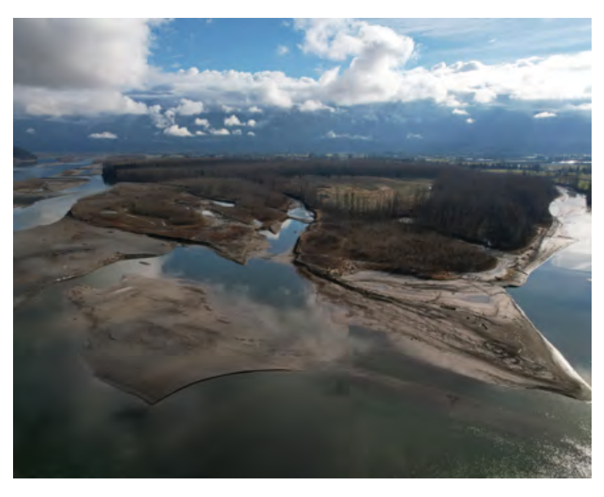
Figure 1: Aerial view of the Heart of the Fraser.

The Heart of the Fraser is an over 80 kilometre stretch of the river that extends from Hope to Mission and is within the unceded traditional territory of the Stó:lō Nation. The Heart of the Fraser begins just upstream from Hope where the river turns into a broad flat valley known as the gravel reach. As the river slows here, the majority of gravel the river is transporting settles out. This process is what created much of the Fraser Valley over the past 10,000 years<sup>3</sup>.