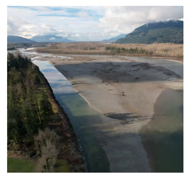
Figure 3: Copyright Watershed Watch