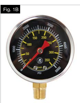
This is the current gauge, 2019 – present. Notice the YELLOW scale. It is NOT the subject of this bulletin.