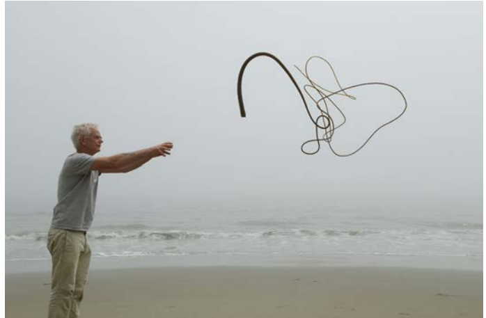
Kelp thrown into a grey, overcast sky. Drakes Beach, California. 14 July 2013. unique archival inkjet print 21 x 31.5 inches

Drawing Water Standing Still also features several new videos, all on view for the first time on the West Coast. Some are body-based incursions within the terrain, at once visceral and proximate, such as Ice walk. Dumfriesshire, Scotland. 6 January 2016 , which traces Goldsworthy's own strenuous physical incursion into the landscape. Other videos, such as