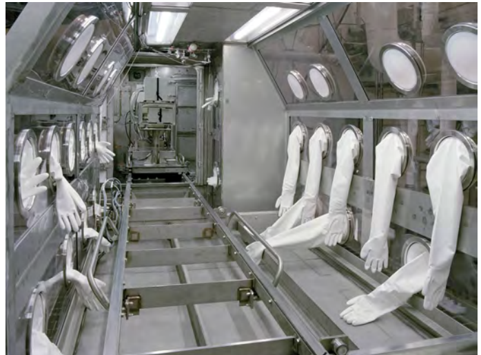
Referee Module Interior (5370_04), Whole System Live Agent Test Laboratory, 2014 archival pigment print 30 x 40 inches