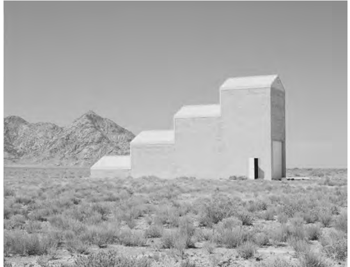
Air Force Target Grid Building 04, Dugway Proving Ground, Utah, 2014 archival pigment print 21 x 27 inches

A series of six black-and-white photographs ( Air Force Target Grid Building , 2014) portrays a ziggurat-like structure from sequential angles, and recalls the stark landscape photography of the New Topographics. An interior image of a test chamber in a laboratory designed for neutralizing and decontaminating biological toxins ( Referee Module Interior , 2014) seems to delineate a zone where our known world encounters an alien other.