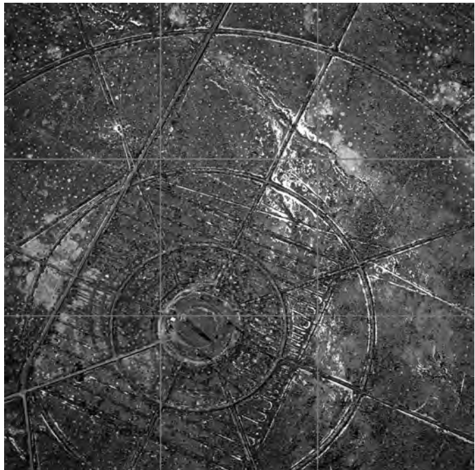
KYDOIMOS: The Din of Battle , 2017 single channel 16:9 projection with surround sound audio 31 minutes 38 seconds sound composition by Chris Kallmyer