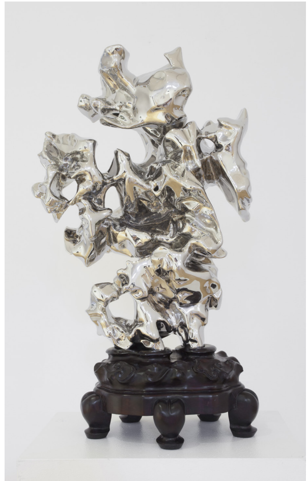
Zhan Wang, Artificial Rock #112 , 2006 stainless steel and wood, 30.5 x 18 x 10 inches

Zhan Wang (b. 1962, Beijing, China) studied in the Beijing Industrial Arts College and the Central Academy of Fine Arts in China. He has exhibited extensively in Asia, Europe and the United States, including the Asian Art Museum, San Francisco, CA; Museum of Fine Arts, Boston, MA; Albright-Knox Gallery, Buffalo, NY; Ullens Center for Contemporary Art, Beijing, China; Fukuoka Asian Art Museum, Japan; Mori Art Museum, Tokyo, Japan; and the Centre Pompidou, Paris, France. He has additionally participated in the Venice Biennale (2004), Singapore Biennale (2008); Vancouver Biennale (2009), and Honolulu Biennial (2017).