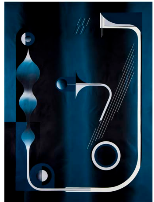
Julian Prebisch, Untitled , 2018 acrylic on canvas, 75 x 46 inches

Los Angeles-based painter Yunhee Min (b. 1964, Seoul, South Korea) foregrounds the sensations of color and light, while drawing to attention to the materiality of paint, its movement and viscosity. Min works with a variety of tools, including brushes, rollers, and squeegees, applying brightly colored swathes of paint that appear to swell and surge across her canvases. In some areas, sheer washes of color may overlap to create new shades; in others, they may thicken and pool together into marbled ripples. Min's paintings appear almost luminescent, and the gestural fluidity of each wide stroke belies the rigorous preparation behind the works, with the artist often spending several days in her studio mixing paint to a specific shade and viscosity.