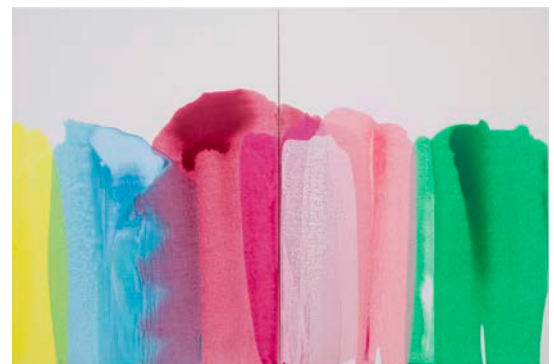
Yunhee Min, Movements (Serpentine 6) , 2015 acrylic on canvas, 41 x 60 inches