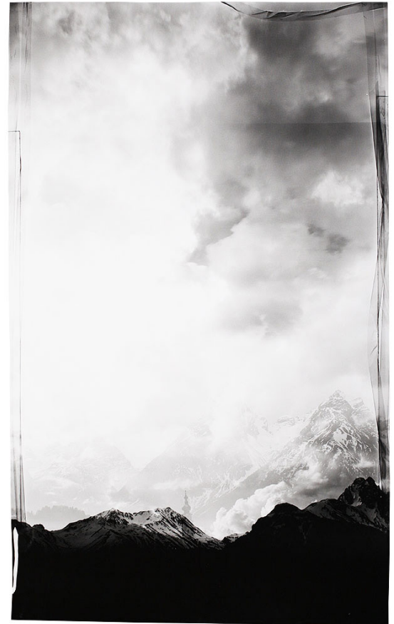
John Chiara, Ftan at Aval Val Püzza , 2020 Camera Obscura Direct Positive Photograph, Unique, 47.75 x 29.25 inches

Irene Fung irene@hainesgallery.com / 415.397.8114