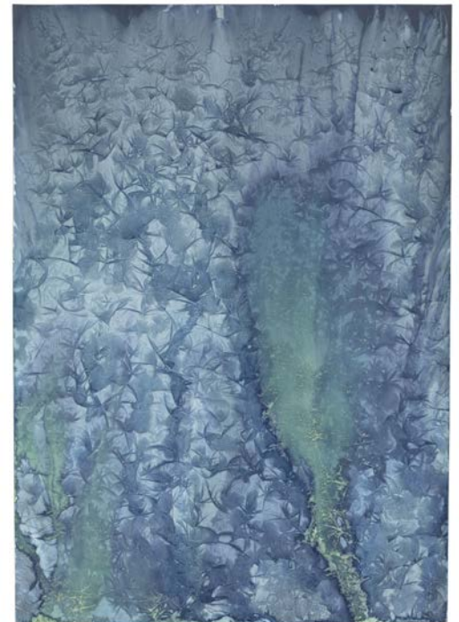
Meghann Riepenhoff, Ice #311 , 2022 Unique Dynamic Cyanotype, 60 x 42 inches