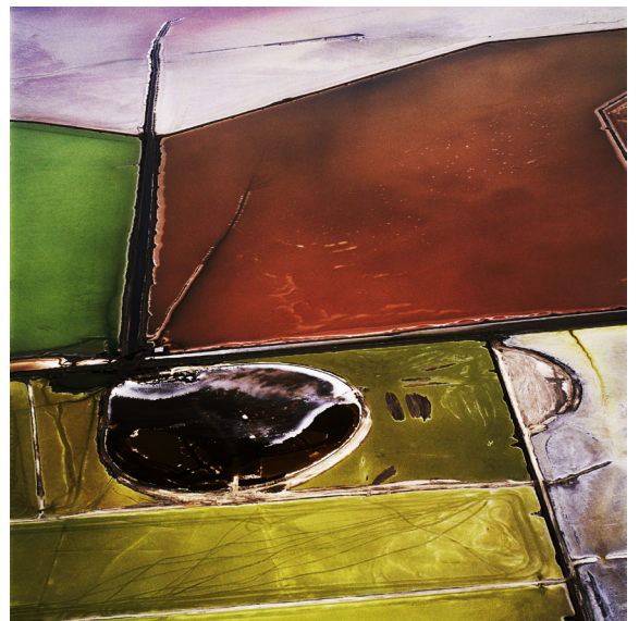
David Maisei, Terminal Mirage 18 , 2003 Archival pigment print, 48 x 48 inches, edition of 5 + 2 AP