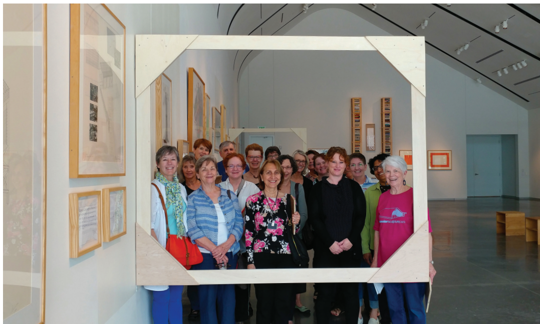
Drawing from the Collection: 40 Years at Laumeier, 2017.

Laumeier offers ongoing opportunities for Volunteers in a variety of areas. Contact 314.615.5271 or volunteer@laumeier.org with questions or for more information.