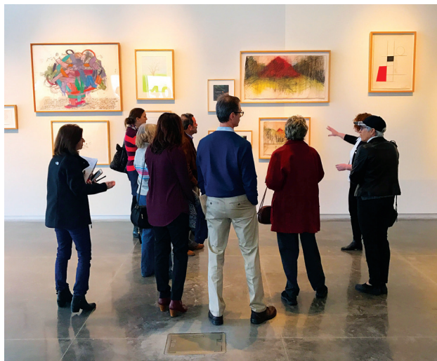
Drawing from the Collection: 40 Years at Laumeier, 2017.

Laumeier's Conversation Series provides free, informal learning opportunities through discussion about art and nature with staff members, visiting artists and community leaders. Conversation Series events encourage participants to share ideas and ask questions in a relaxed atmosphere. Refreshments are always provided!