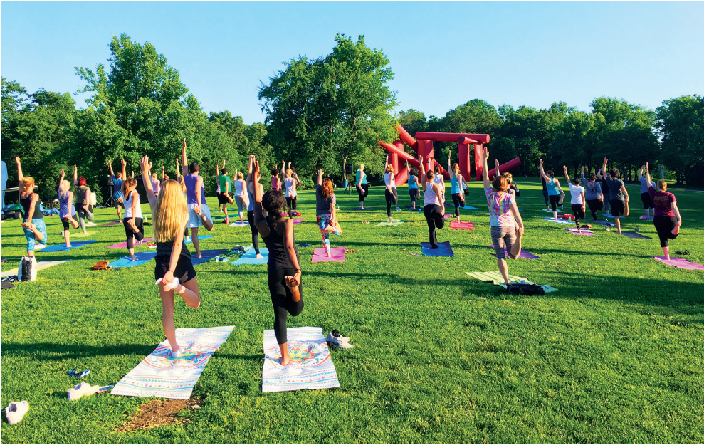
Alexander Liberman, The Way , 1972–80.