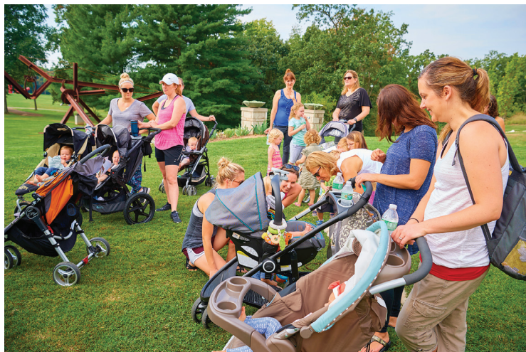
Mark di Suvero, Bornibus , 1985–87.

May 3 / May 17 / June 7 / June 21 / July 5 / July 19 / August 2 / August 16 / September 6 / September 20 / October 4 / October 18