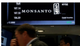
BIG AG M&A

Explore our selection of articles below for details on these recent developments and topics.