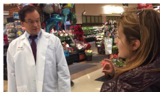
FOOD AS MEDICINE