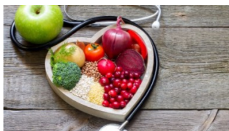
FOOD & HEALTHCARE

Explore our selection of articles below for details on these recent developments and topics.