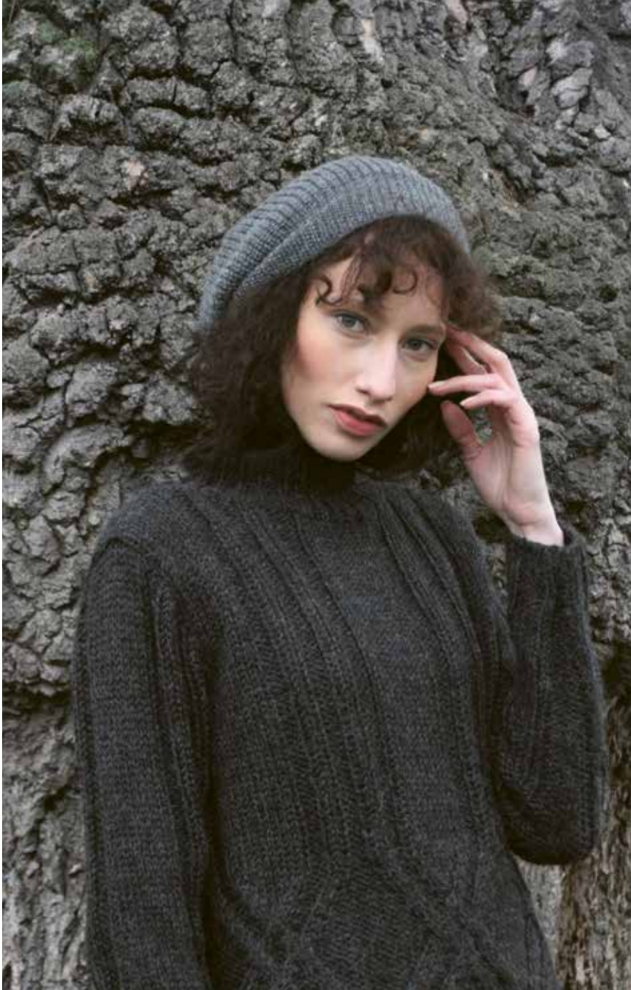
sweater Dorothy : alpaca 100% / sizes S, M, L, XL / ivory, cocoa, dove, charcoal, amber hat Greta ; alpaca 100% / size onesize / ivory, pebble, cocoa, dove, charcoal, amber