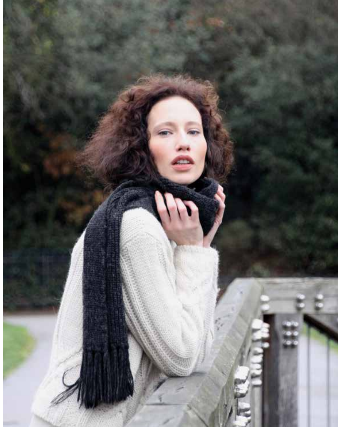
sweater Dorothy : alpaca 100% / sizes S, M, L, XL / ivory, cocoa, dove, charcoal, amber scarf Enna : size 28 x 146 cm / ivory, pebble, dove, charcoal, amber