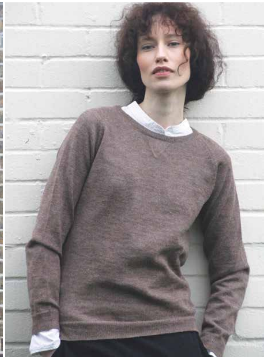
sweater Judith : alpaca 100% / sizes S, M, L, XL / cocoa, dove, charcoal