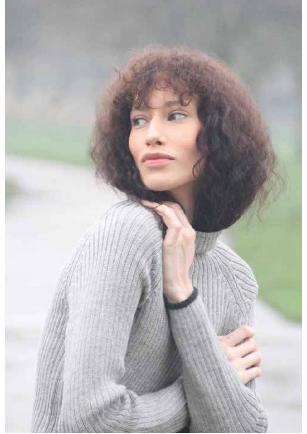
sweater Erica 2-tone : alpaca 100% / sizes S, M, L, XL / pebble + water, dove + charcoal, charcoal + amber