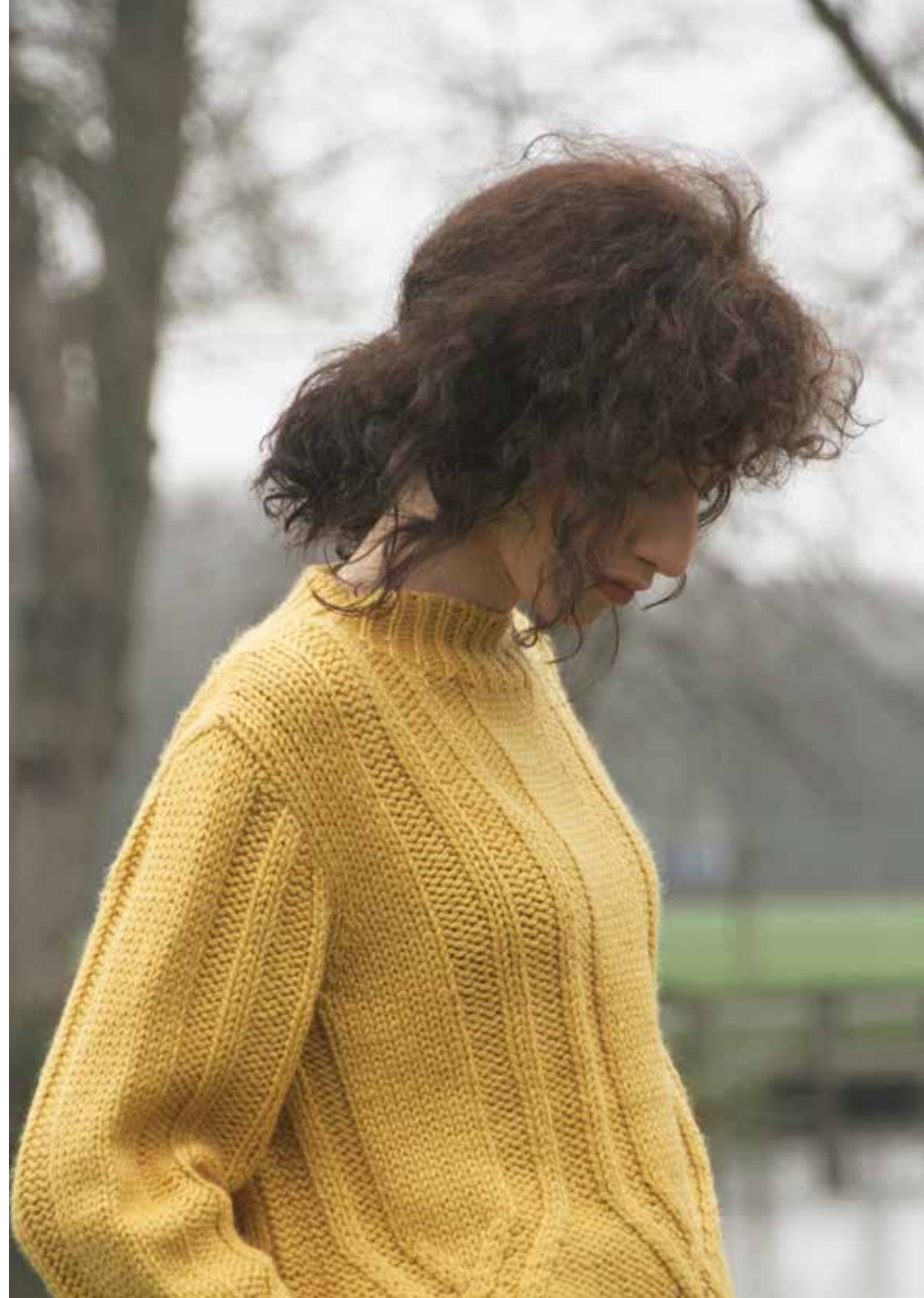
sweater Dorothy : alpaca 100% / sizes S, M, L, XL / ivory, cocoa, dove, charcoal, amber