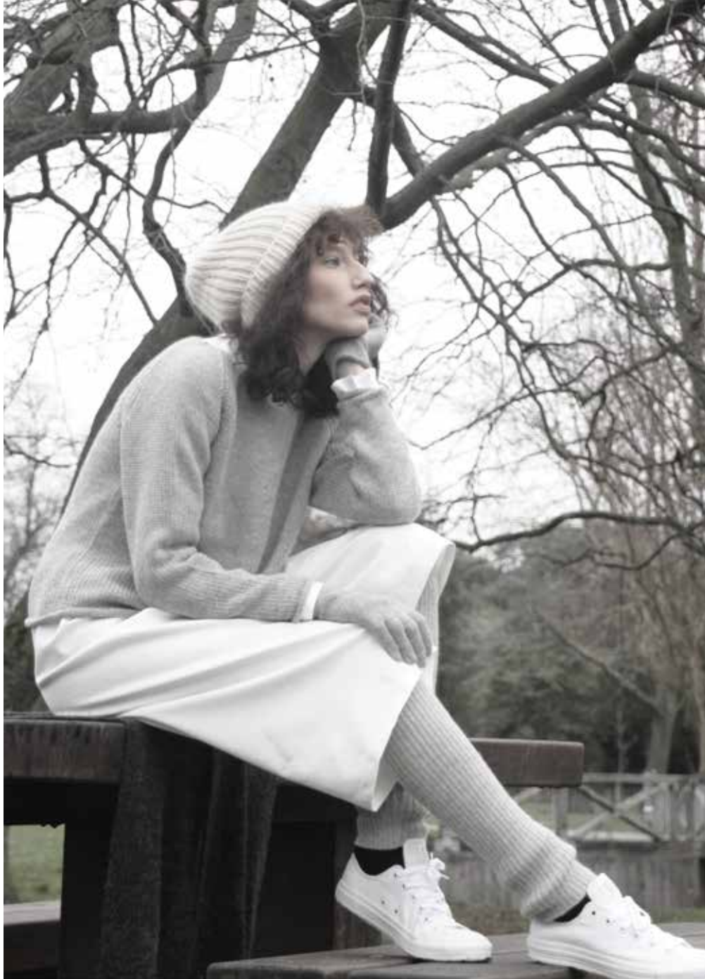
sweater Masha : alpaca 100% / sizes S, M, L, XL / pebble, dove, charcoal, hat Michel : alpaca 100% / one size / ivory, pebble, cocoa, dove, charcoal, amber gloves Mia : alpaca 100% / one size / ivory, pebble, cocoa, dove, charcoal, amber leggings : alpaca 100% / sizes S, M, L, XL / ivory, pebble, cocoa, dove, charcoal, navy