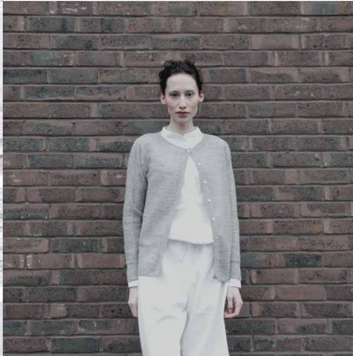
above cardigan Gaby : alpaca 100% / sizes S, M, L, XL / pebble, cocoa, dove, charcoal left sweater Cathy : alpaca 93% Polimide 7% / sizes S, M, L, XL / ivory, pebble, charcoal