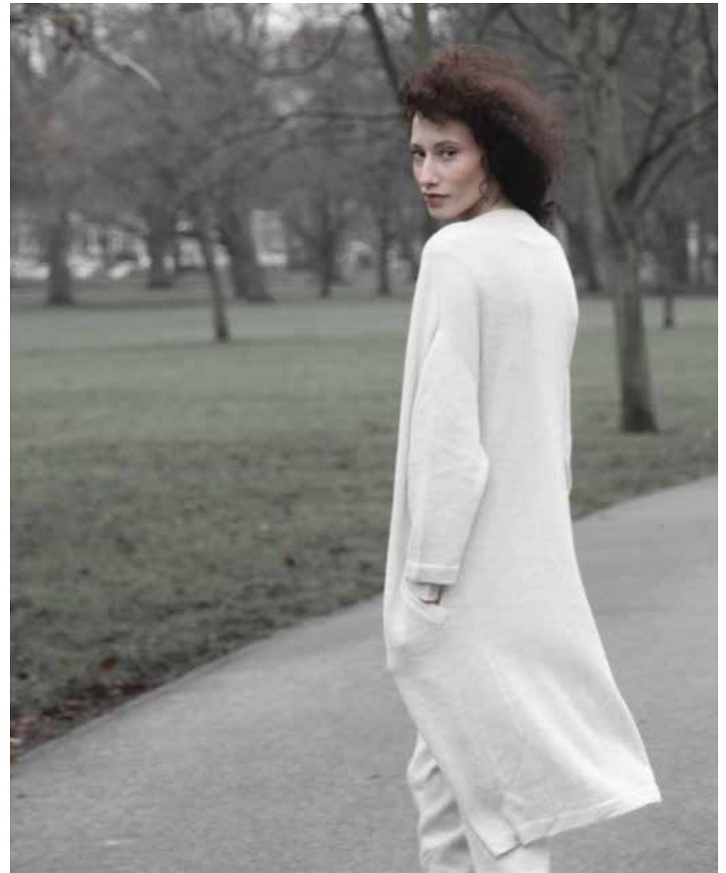
sweater Mika : alpaca 100% / sizes S, M, L, XL / ivory, dove, charcoal, amber cardigan Kaya : alpaca 100% / sizes S, M, L, XL / ivory, dove, charcoal pants Mana : alpaca 100% / sizes S, M, L, XL / ivory, dove, charcoal, navy