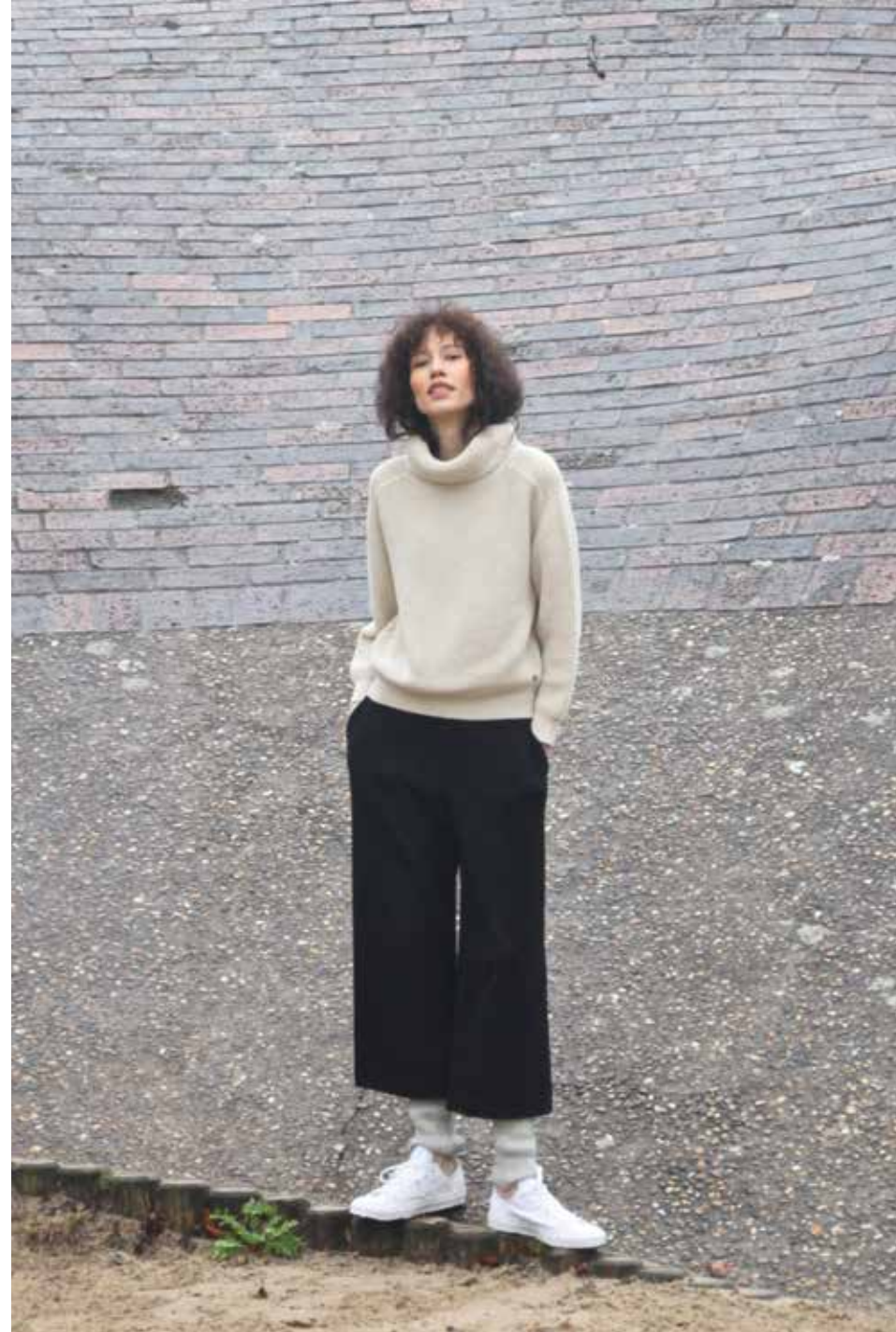
sweater Meggie : alpaca 100% / sizes S, M, L, XL / ivory, pebble, cocoa, dove, charcoal, navy leggings : alpaca 100% / sizes S, M, L, XL / ivory, pebble, cocoa, dove, charcoal, navy