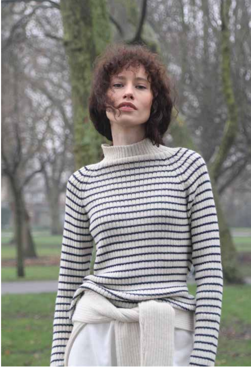
sweater Erica stripe : alpaca 100% / sizes S, M, L, XL / ivory + navy, dove + charcoal, pebble + cocoa