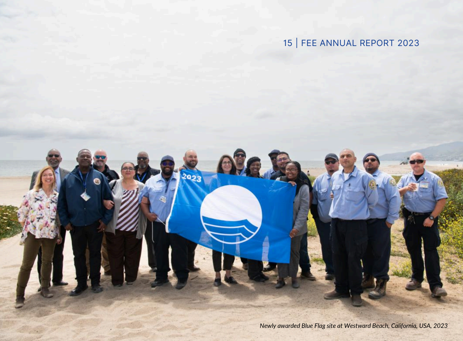
Newly awarded Blue Flag site at Westward Beach, California, USA, 2023