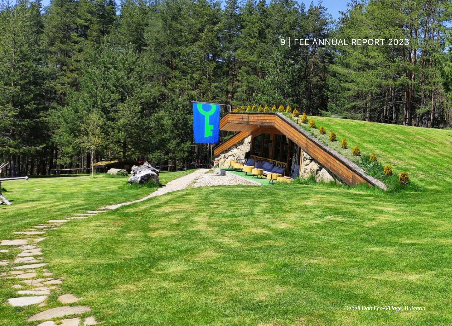
Debeli Dab Eco-Village, Bulgaria