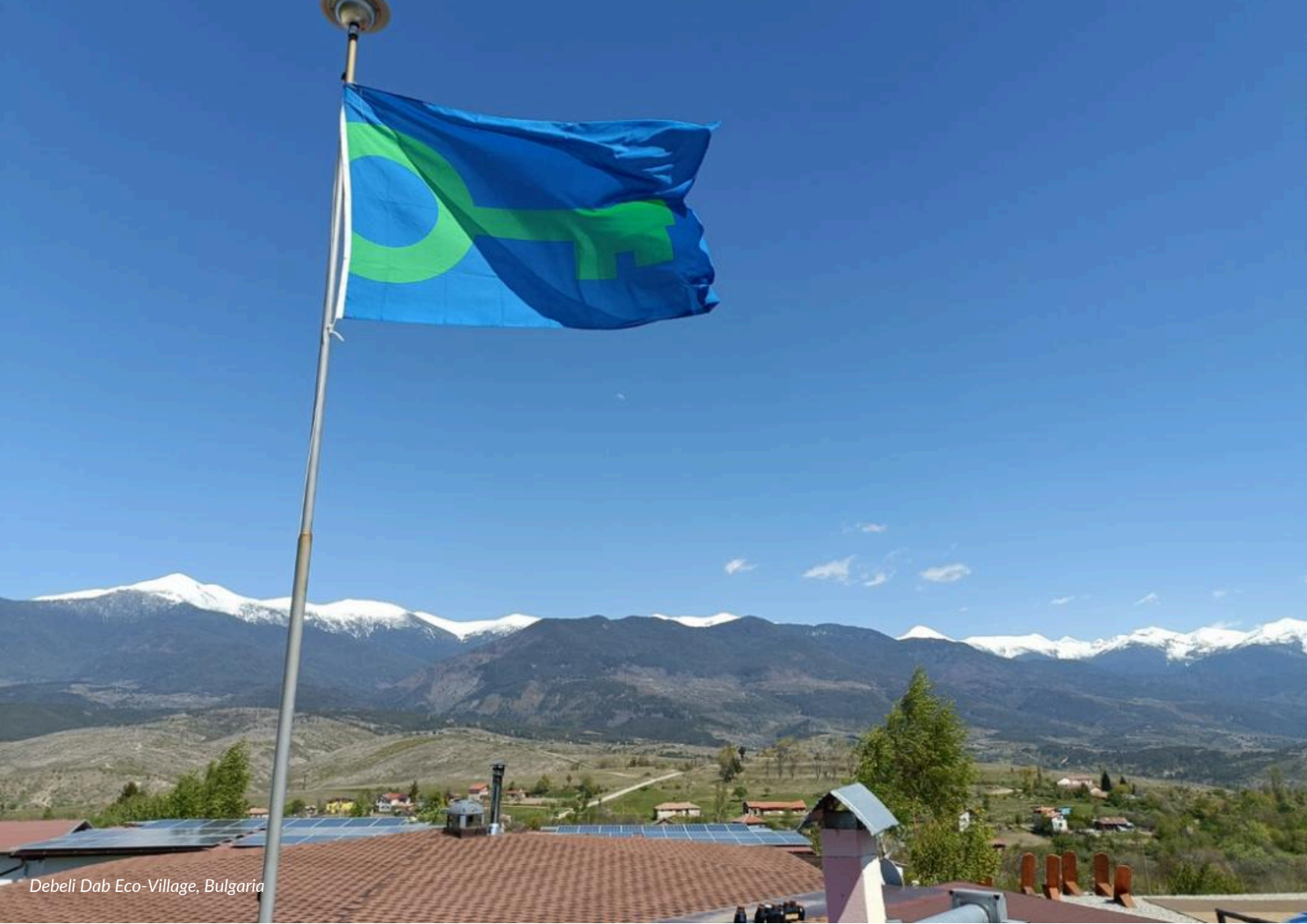
Debeli Dab Eco-Village, Bulgaria