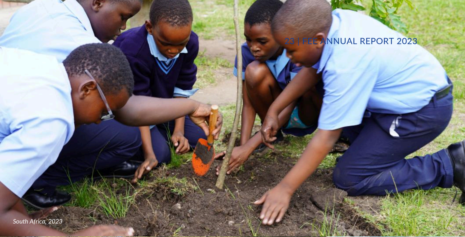
South Africa, 2023