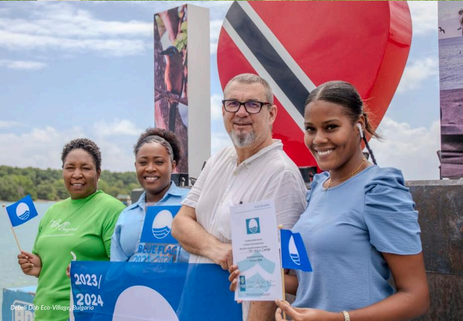
Debeli Dab Eco-Village, Bulgaria