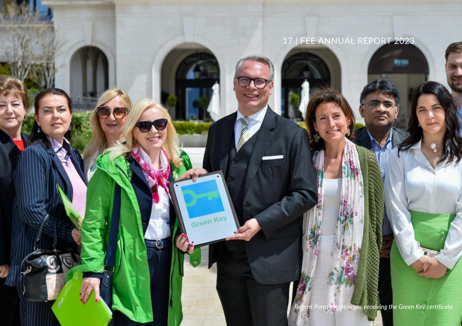
Regent Porto Montenegro, receiving the Green Key certificate