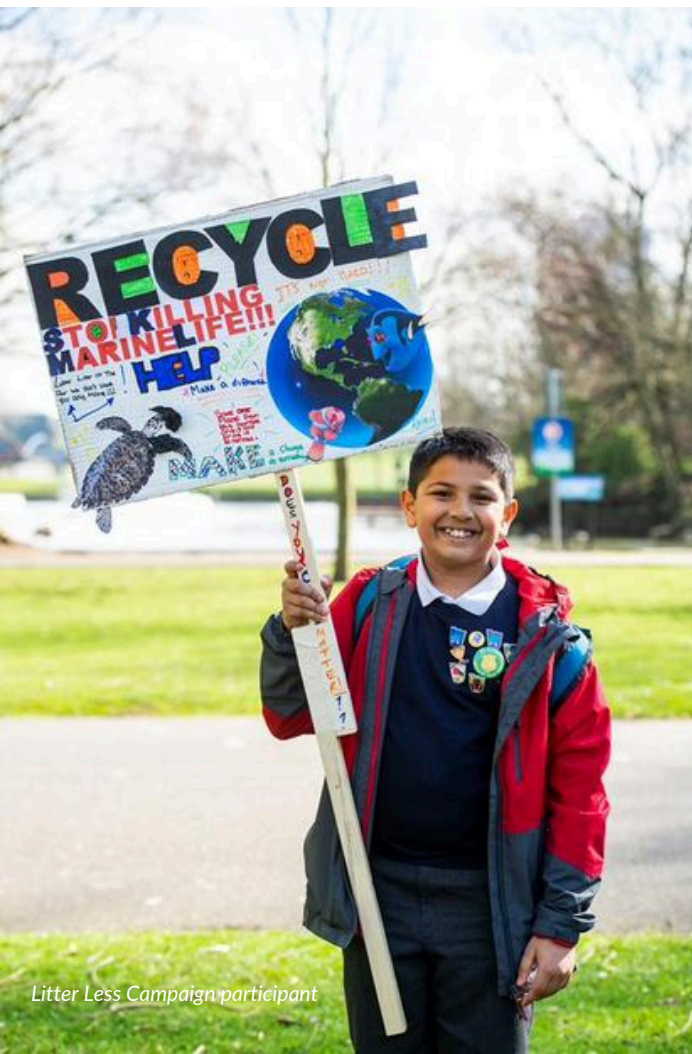
Litter Less Campaign participant

Circular Economy Projects in Schools: FEE received 110 project proposals from teachers around the world and disseminated 60 grants; each about €500 to schools from 13 countries. The schools designed and implemented projects on circular economy on the whole school approach and submitted reports on their projects.