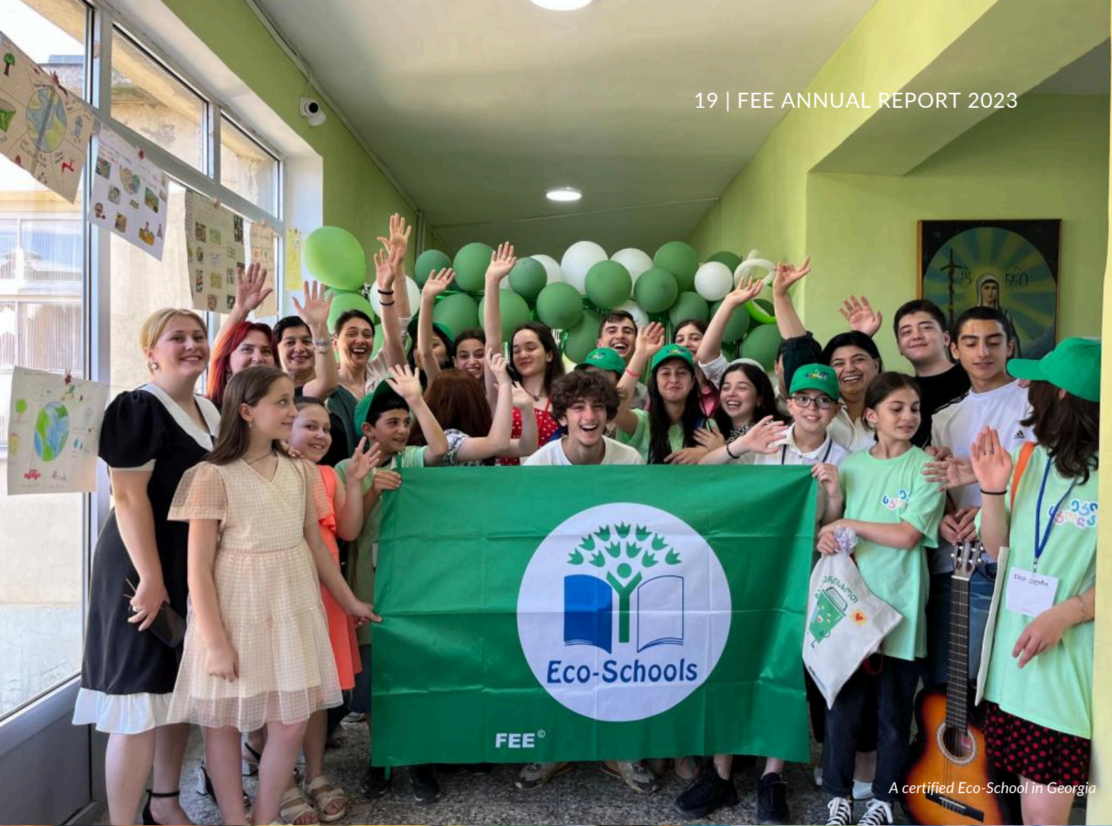
A certified Eco-School in Georgia