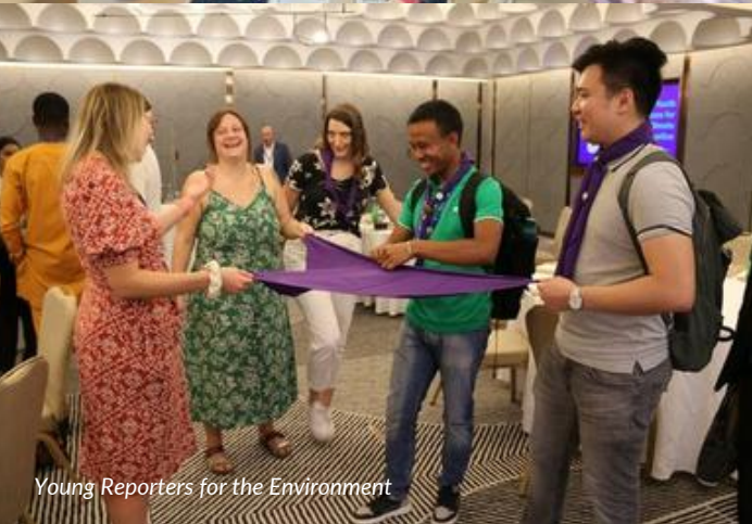
Young Reporters for the Environment