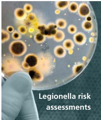
Legionella risk assessments