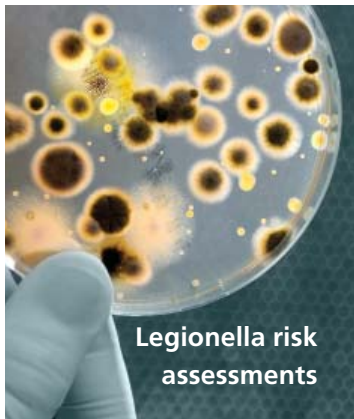
Legionella risk assessments