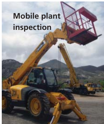
Mobile plant inspection