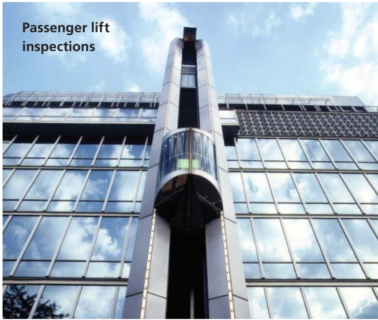
Passenger lift inspections