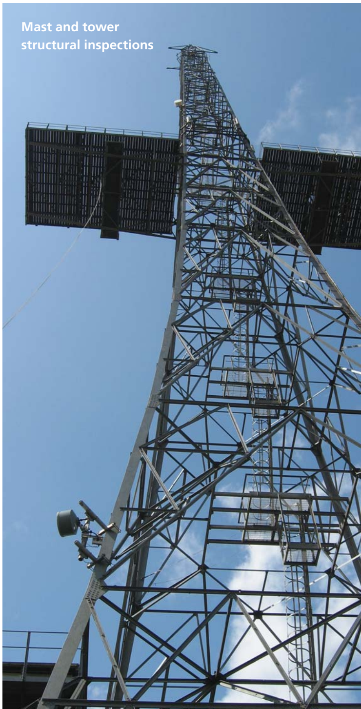
Mast and tower structural inspections