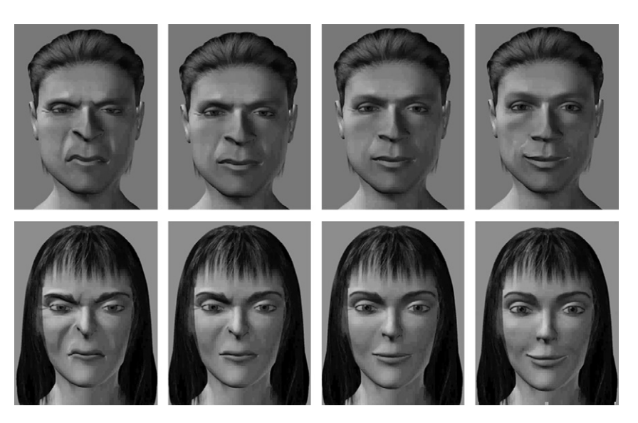
Fig. 1. Four frames of one contempt-to-happy movie with the male (top) and female (bottom) target faces. The figure shows gray-scale reproductions of the original color image.

sions. This was done to establish generality across the specific exemplars. All emotions were created based on Ekman's (2003) descriptions and photographs.