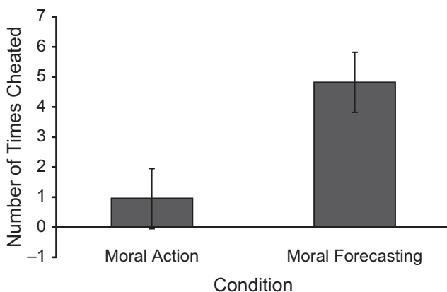
Fig. 1. Mean number of times that participants in the moral action condition cheated on the math test and mean number of times that participants in the moral forecasting condition predicted they would cheat in the same situation. Error bars indicate standard errors.

The primary goal of this experiment was to explore the relationship between moral action and moral forecasting. We conducted a one-way (action vs. forecasting) ANOVA, which revealed that participants who completed the math task cheated significantly less ( M = 0.96 problems, SD = 1.65 ) than participants in the forecasting condition predicted ( M = 4.82 , SD = 5.32 ), F(1, 37) = 10.43 , p < .01 , d = 0.98 (see Fig. 1). 2 In other