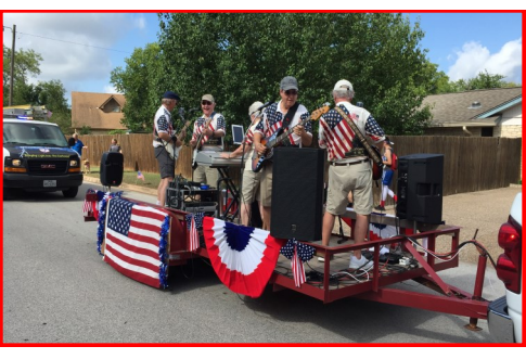
Guards did many things to make the 4th a success including the pool games.

parade. As always, our Shady Hollow Life