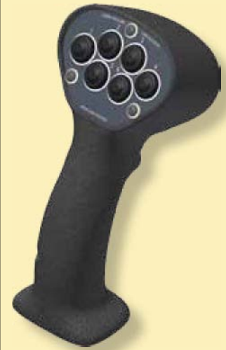
Shown Without Cable