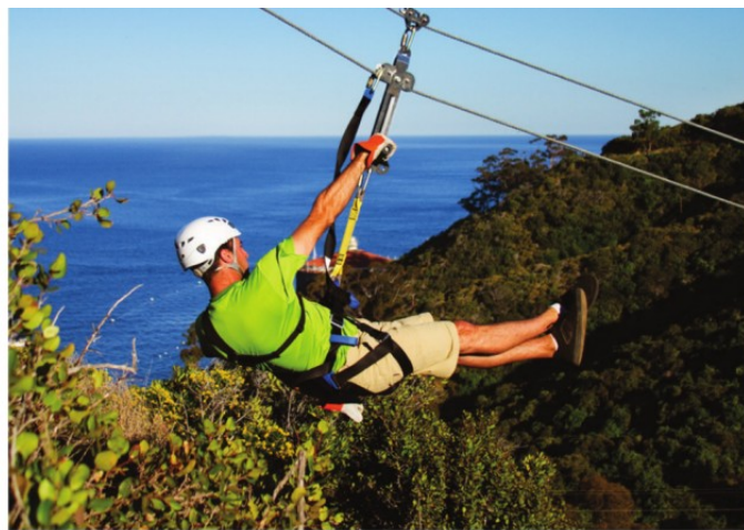
Aerial Adventure (left) and Catalina Zip Line (right)

certainly help, but the self-paced activity lends itself to those less athletically inclined as well.