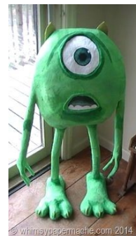
Week 2 Monsters