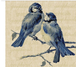
Week 3 Mixed Media