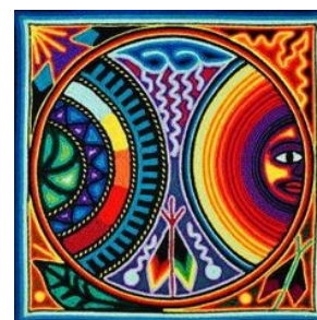
Week 4 Huichol Art