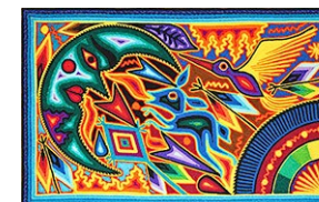
Week 4 Yarn Painting