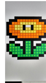
Week 2 Pixel Art