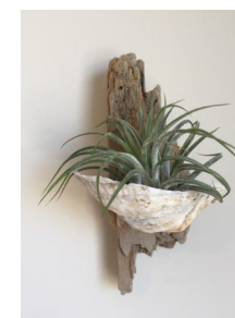
Week 3 Earth Arts