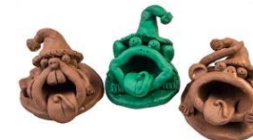
Week 3 Sculpting