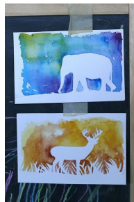
Week 6 Animal Art

** All day special (8 am - 5 pm) = $175 * Scholarships are available for partial class fees. **All classes subject to change Additional child in same family discount - 20% off fees for 2 nd , 30% off for 3 rd , 40% off for 4 th .