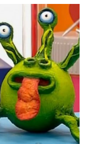
Week 2 Monsters