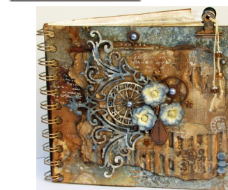
Week 3 Mixed Media