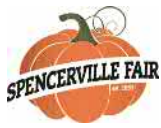
Photo & Video Submission Guidelines

Entrants submitting photos and videos to compete in the 166th Spencerville Fair Virtual Edition, must ensure their submissions meet the following: