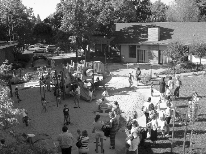
Fremont Nursery School's playground is just outside the classrooms.

Fremont believes that the preschool years are critical for a child's social, intellectual, emotional, physical and spiritual growth. These fundamental skills are important for success in both school and life. Our caring staff facilitates endless opportunities for children to think, explore and grow in a hands-on, multi-sensory environment. We provide an age appropriate, comprehensive program with meaningful learning in all developmental areas. Our school provides abundant enrichment opportunities for the whole child. Our goal is to provide a safe and nurturing Christian environment where students can grow at their own developmental level within a well-rounded, play based and thematic curriculum.